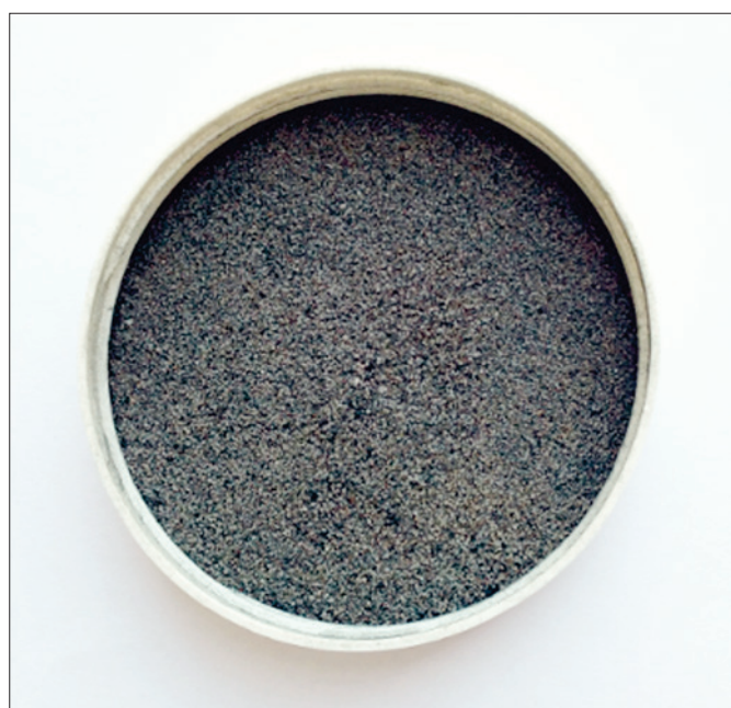
Figure 1 Sugarcane bagasse ash (SCBA) sample

The preparation of the SCC's was performed as described by Molin Filho [18]. The self-compacting parameters were proved by tests of self-compactibility recommended by NBR 15823-1 [1] (Slump-flow, J-Ring, V-Funnel and L-Box Tests) and by Gomes and Barros [2] the segregation resistance test by U-Pipe. It is important to emphasize that the method described by NBR 15823-6 [29] for determination of the segregation resistance by