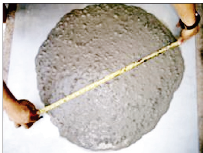
(b) Concrete with 10% of SCBA