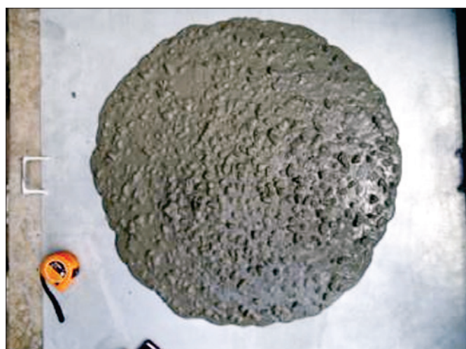
(a) Concrete without SCBA