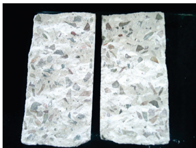
(b) SCC SCBA10%