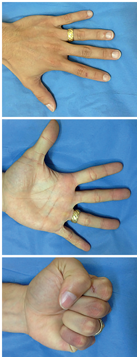
Figure 5. Postoperative clinical evaluation

injury of the FDS occurred in zone 2 6 . In the study by Soro et al. 6 , the rupture occurred in zone 3. Regarding the FDP, the tendon was affected in zone 2 in two cases and in zone 1 in all other cases.