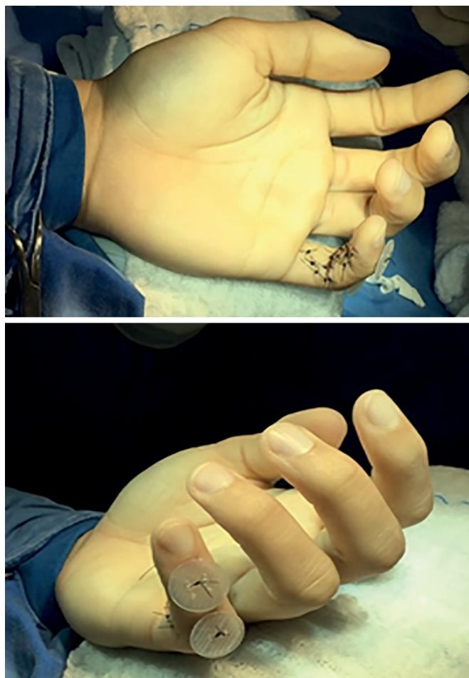
Figure 4. Intraoperative outcome after reinsertion of the tendons using the pull-out technique.

Avulsion injuries of the deep flexor tendon at its insertion at the base of the distal phalanx of the fingers is common, especially in athletes and men, with a prevalence for the ring finger that accounts for 75% of these lesions 5 . Conversely, injuries in the superficial flexor tendon of the fingers are uncommon and mainly affect the ring or middle finger 5 . A closed lesion of both tendons is rare and only nine cases have been described in the literature since 1984 6 .