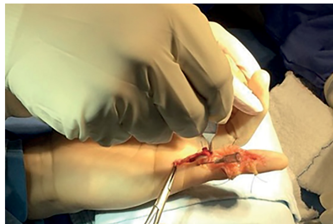
Figure 2. Complete and simultaneous rupture of the flexor tendons of the fifth finger.

repaired. A dressing was applied after suturing, followed by immobilization with a dorsal splint with 10° of wrist extension and 90° flexion of the metacarpophalangeal joints (Figure 4).