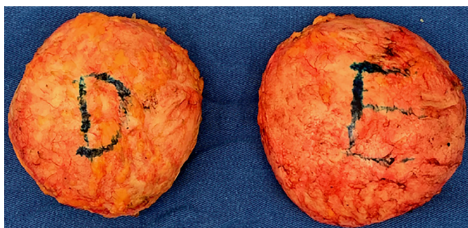
Figure 1. Bilateral total capsulectomy with intact capsules (popularly called en bloc).

En bloc resection consists of resection of the implant, its capsule and adjacent tissues (safety margin) without capsule violation. In the context of BII, there is no evidence of capsule disease, and the incidence of capsular pathologies is extremely low (0.2%). Total capsulectomy should be performed preferably (Figures 1 and 2), as long as it is technically feasible and safe. Special attention should be given to implants in the retromuscular plane, always weighing the risk-benefit ratio, given the possibility of chest wall perforation, pneumothorax and even death 17 .