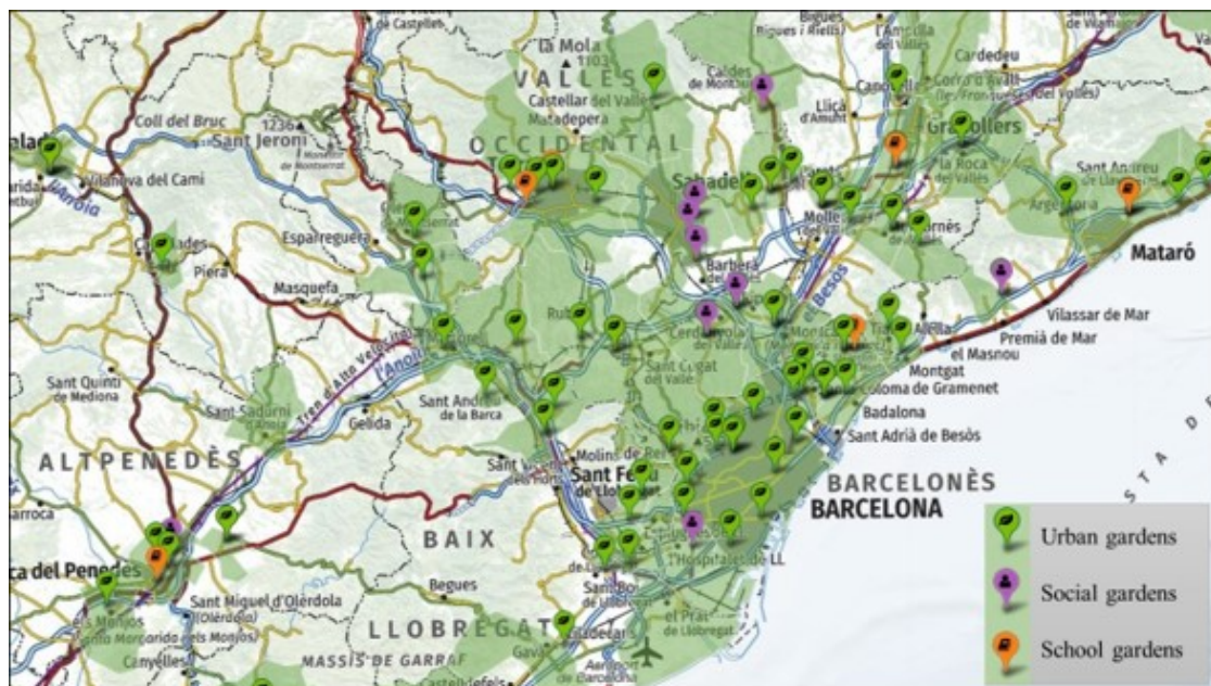
Figure 1 - Some of the existing vegetable gardens in Barcelona Metropolitan Area (Catalonia). Source: Xarxa de Ciutats i Pobles cap a la Sostenibilitat. July 2017. Map developed, using different sources, by Jordi Montagut Alandi as a result of an internship at Barcelona Provincial Council.

The commitment of the city of Barcelona with the Milan Food Policy Pact led to the development of the Strategy for the Promotion of Food Policy 2016-2019 of Barcelona City Council. This Strategy seeks to move towards food sovereignty influencing the entire food chain from the production to the consumption. Some of the actions focus on increasing agriculture production in and around the city, promoting urban vegetable gardens, creating a “farmland bank” and encouraging urban livestock in the Collserola Natural Park, amongst others.