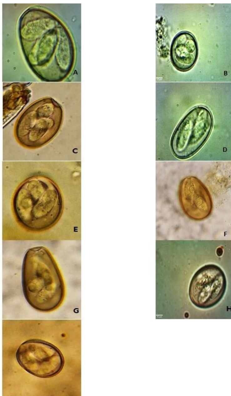
Figure 1. Images from optical microscope of sporulated Eimeria species oocyst observed (x 1000 magnification) (A) E. bovis , (B) E. zuernii , (C) E. canadensis , (D) E. cylindrica , (E) E. alabamensis , (F) E. wyomigensis , (G) E. auburnensis , (H) E. ellipsoidal and (I) E. subspherica .