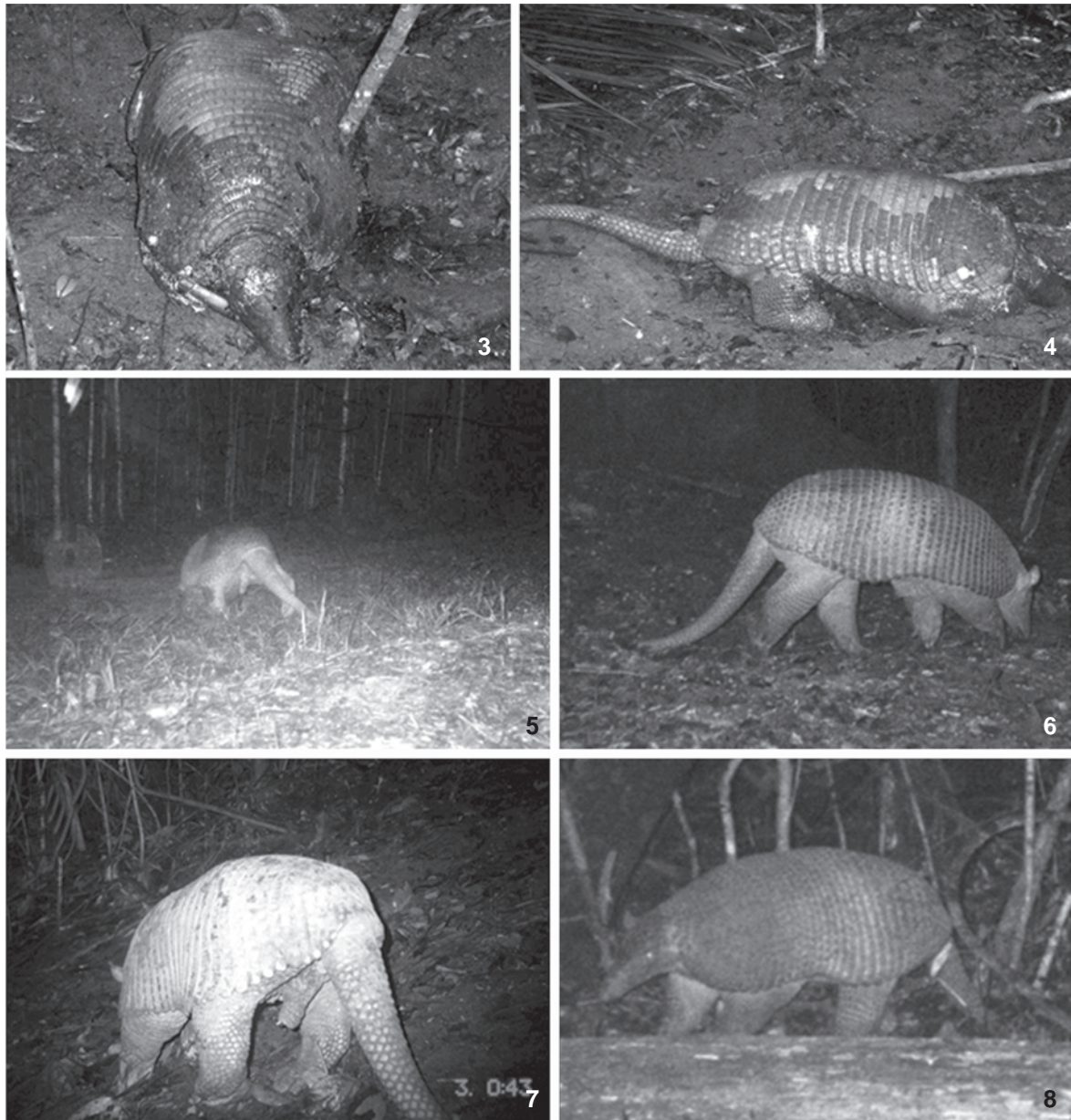
Figures 3-8. Some records of P. maximus obtained in Reserva Biológica de Sooretama (3-5) and in Parque Estadual do Rio Doce (6-8). (3-4) Carcass, (5-8) camera-trap records. See text for details.