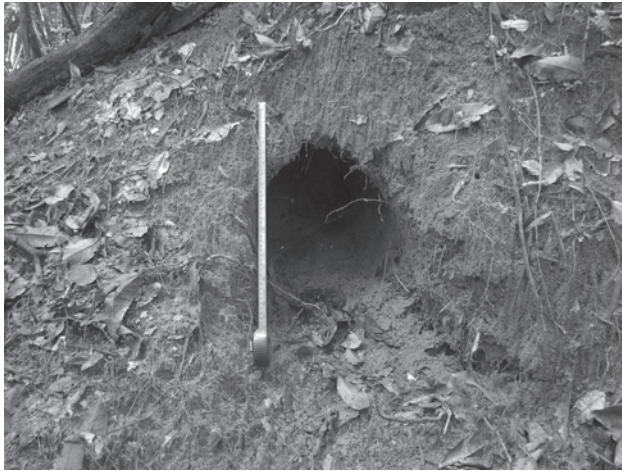
Figure 1. A typical burrow of P. maximus found in Parque Estadual do Rio Doce. The measuring tape is extended to 0.5 m.

they are easily distinguished in the field. In the next two paragraphs, camera trapping details are provided for each reserve separately.