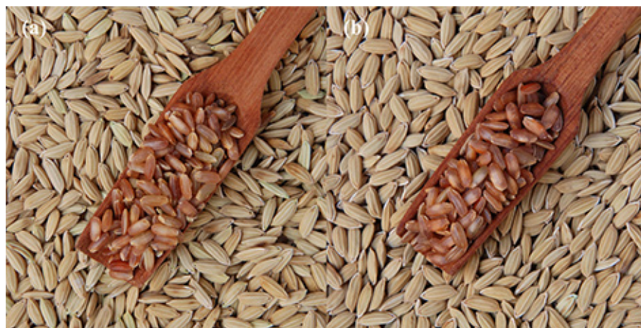
Figure 1. Paddy and whole grain of (a) BRS 901 and (b) BRS 902.