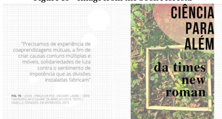
Figure 19 – Image from the book Floresta 2

Note: Figure translation: “We need experience of mutual co-learning, in order to create multiple and mobile common causes, solidarities of struggle against the feeling of impotence that the installed divisions manufacture”. FIG. 70 - PRAÇA DA PAZ, UNICAMP. LAMBE | SERIES “SINTROPIZ-AR O OLHAR” OF MARÍLIA COSTA. TEXT | ISABELLE STENGERS, IN INTERVIEW 2015.