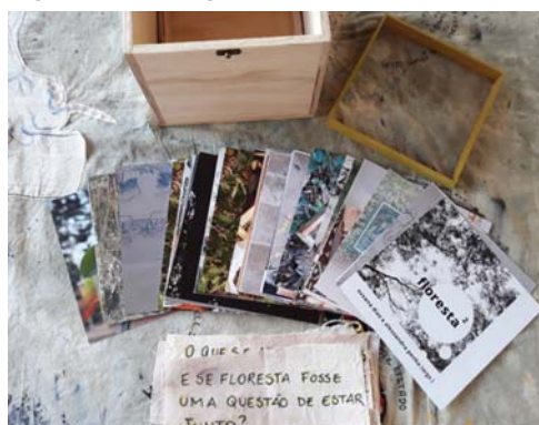
Figure 7 – Image from the book Floresta 2