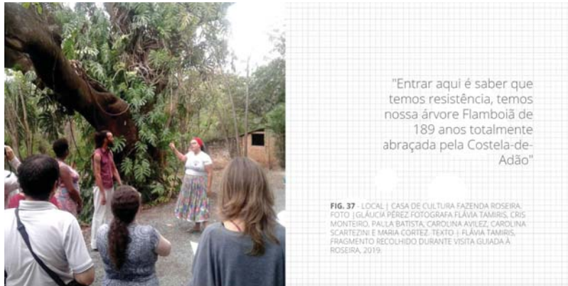
Figure 15 – Image from the book Floresta 2

Note: Figure translation: “Entering here is knowing that we have resistance, we have our 189-year-old Flamboyant tree totally embraced by the Swiss cheese plant”. FIG. 37 – CASA DE CULTURA FAZENDA ROSEIRA. PHOTO | GLAUCIA PÉREZ PHOTOGRAPHS FLÁVIA TAMIRIS, CRIS MONTEIRO, PAULA BATISTA, CAROLINA AVILEZ, CAROLINA SCARTEZINI AND MARIA CORTEZ. TEXT AND FLAVIA TAMIRIS, FRAGMENT COLLECTED DURING GUIDED TOUR, ROSEIRA, 2019. Source: Dias and Penha (2019).