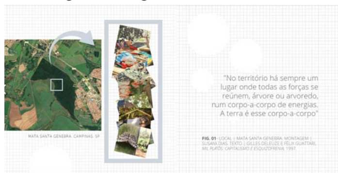
Figure 8 – Image from the book Floresta 2

Note: Figure translation: In the territory there is always a place where all forces come together, tree or grove, in a melee of energies. The earth is this melee”; FIG. 01 MATA SANTA GENEBRA MONTAGE | SUSANA DIAS. TEXTO | GILLES DELEUZE E FÉLIX GUATARI, MIL PLATÔS: CAPITALISMO E ESQUIZOFRENIA, 1997.