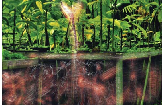
Figure 1 – Image from the book Floresta de Luz: Laboratório de Botânica Especulativa