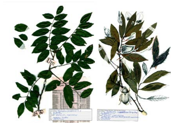
Figure 4 – Images from the book Floresta de Luz: Laboratório de Botânica Especulativa

In our creation, we have introduced a change to this process. When we were creating the exsicatas , I invited the students to observe the relationship between the collected plants and the newspapers, something I did in my biology course and a gesture that is related to my commitment, since my doctorate, to pay attention to the materials associated with the field of communication, especially paper (newsprint, magazine paper, photographic paper, painting canvas paper, tv screen paper, multimedia paper, etc.) (Dias, 2008). I suggested that we not completely discard the newspapers and bring them to the exsicatas , transforming them into collages that would experience the coexistence of these materials: dry plants, paper, words, and images. All exsicatas promoted coexistence between heterogeneous materials, experimenting with coexistence and co-creation between lines of nature and culture. Plants were no longer presented as part of the untouched and isolated nature of worlds, under the signs of neutrality, objectivity, and reality-truth, but intimately sewn to the worlds of cultures, mobilizing real perspectives but promiscuous and fictional.