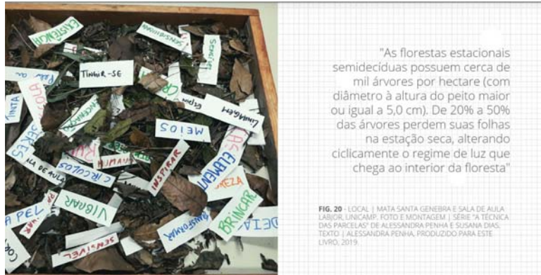
Figure 12 – Image from the book Floresta 2

amid the manipulation of water and clay as if asking creation to continue with this thinking with the hands, in that attentive inattention that involves doing something while listening.