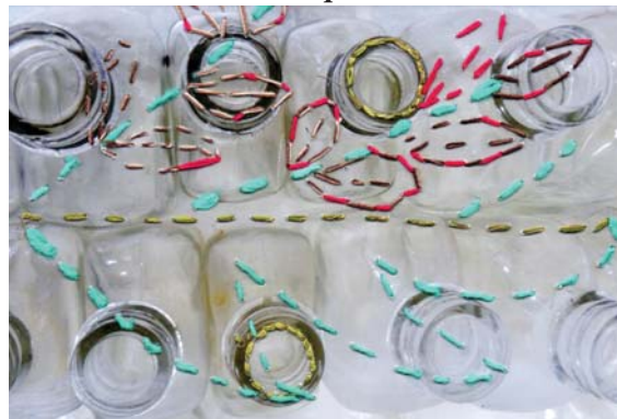
Figure 2 – Image from the book Floresta de Luz: Laboratório de Botânica Especulativa