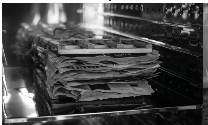
Figure 3 – Image from the book Floresta de Luz: Laboratório de Botânica Especulativa

With Deleuze and Guattari (1995), we can think differently in terms of “form of content” and “form of expression”, assuming another distinction, which no longer operates by the opposition, in which form is always on stage, being the form of content linked to the set of material relations and the form of expression associated with the regimes of signs. With this possibility, the call is no longer to attribute one of the two forms to the sciences and the other to the arts but to pay attention to the assemblages between them. I will try this by presenting some exercises in the courses and two book-objects we produced regarding the biological sciences’ procedures, materials, and signs that mobilized creative intersections with the arts.