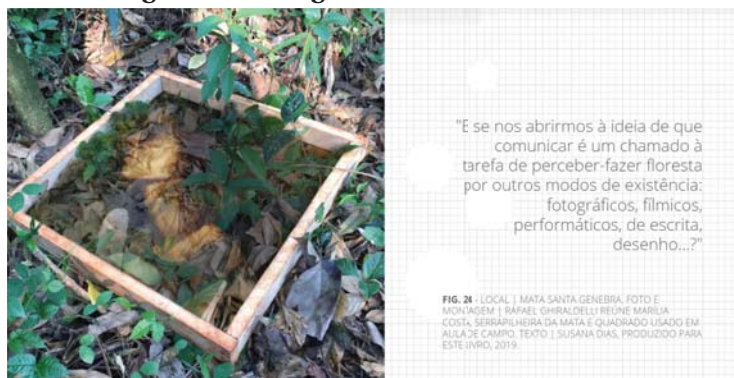
Figure 13 – Image from the book Floresta 2

Note: Figure translation: "What if we open ourselves to the idea that communicating is a call to the task of perceiving-making a forest through other modes of existence: photographic, filmic, performative, writing, drawing...?". FIG. 24- MATA SANTA GENEBRA. FOTO AND MONTAGE | RAFAEL GHIRALDELLI REJINE MARILIA COSTA, SERRAPILHEIRA DA MATA E QUADRADO USADO EM AULA DE CAMPO. TEXT | SUSANA DIAS, PRODUCED FOR THIS BOOK, 2019.