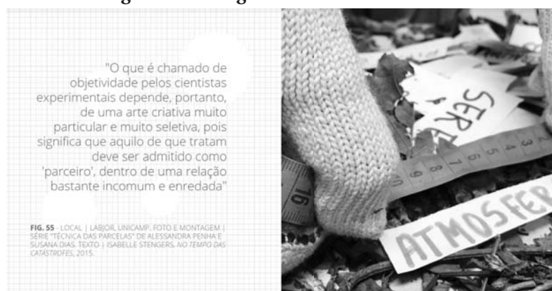
Figure 17 – Image from the book Floresta 2

Note: Figure translation: “What is called objectivity by experimental scientists therefore depends on a very particular and very selective creative art, as it means that what they are dealing with must be admitted as a ‘partner,’ within a very unusual and entangled relationship”. FIG. 55- LABJOR, UNICAMP. PHOTO AND MONTAGE | SERIES “TECHNIQUE OF THE PLOTS” BY ALESSANDRA PENHA AND SUSANA DIAS TEXT | ISABELLE STENGERS. NO TEMPO DAS CATÁSTROFES, 2015.