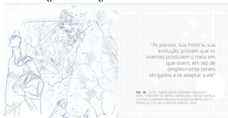
Figure 11 – Image from the book Floresta 2

Note: Figure translation: “Plants, their history, their evolution, prove that living beings produce the environment in which they live, instead of simply being forced to adapt to it”. FIG.18 - MATA SANTA GENEVRA. DRAWING 1 SERIES “CARBON” BY RAFAEL GHIRALDELLI GATHERS MARÍLIA COSTA. ALESSANDRA PENHA AND PLANTAS DA MATA TEXT | EMANUELE COCCA, A VIDA DAS PLANTAS, 2018.