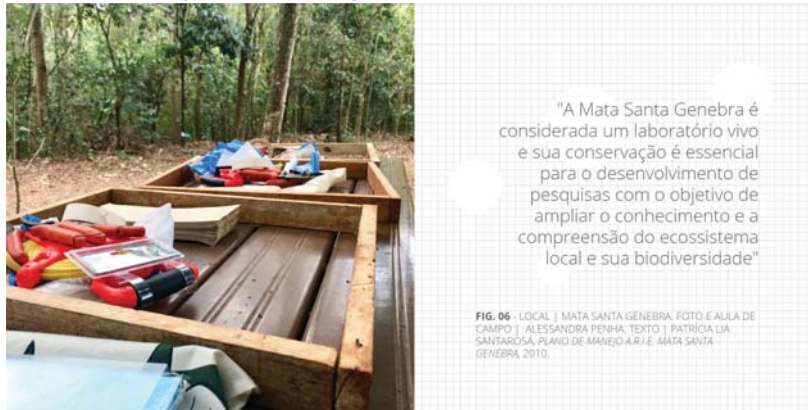
Figure 10 – Image from the book Floresta 2

Note: Figure translation: “Mata Santa Genebra is considered a living laboratory and its conservation is essential for the development of research with the aim of expanding knowledge and understanding of the local ecosystem and its biodiversity”. FIG. 06 MATA SANTA GENEBRA PHOTO AND FIELD CLASS | ALESSANDRA PENHA. TEXTO | PATRICIA LIA SANTAROSA - PLANO DE MANEJO MATA SANTA GENEBRA, 2010. Source: Dias and Penha (2019).