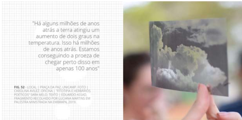
Figure 16 – Image from the book Floresta 2

Note: Figure translation: “A few million years ago the earth reached a two degree rise in temperature. That’s millions of years ago. We’re achieving the feat of getting close to that in just 100 years”. FIG. 52 - PRAÇA DA PAZ. UNICAMP. WORKSHOP | ‘PHYTOTYPE AND HERBARIA POE PEAKS’ SARA MELO. TEXT | EDUARDO ASSAD. FRAGMENT COLLECTED BY LUCIANA MARTINS IN A LECTURE GIVEN AT EMBRAPA 2019.