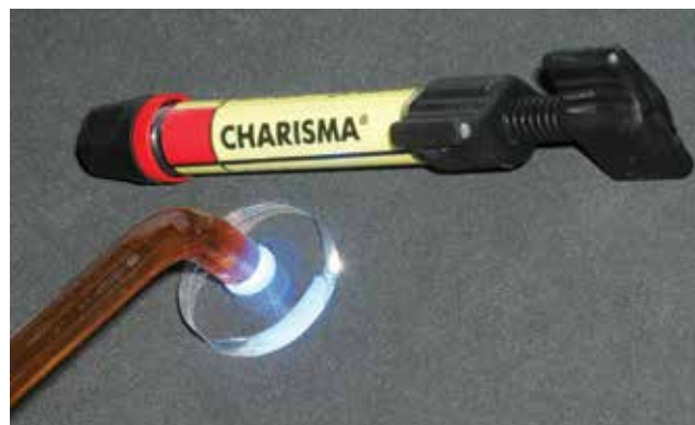
Figure 1 - Light curing of specimens filled with resin composite.

The specimens were divided into 28 groups of 10 elements, separated according to the type of surface treatment, type of resin composite and the use / non-use of silane (Table 1). The resinous surfaces were treated by the following agents: 37% phosphoric acid (Dental G Conditioner, Dentsply, Petrópolis, RJ) for