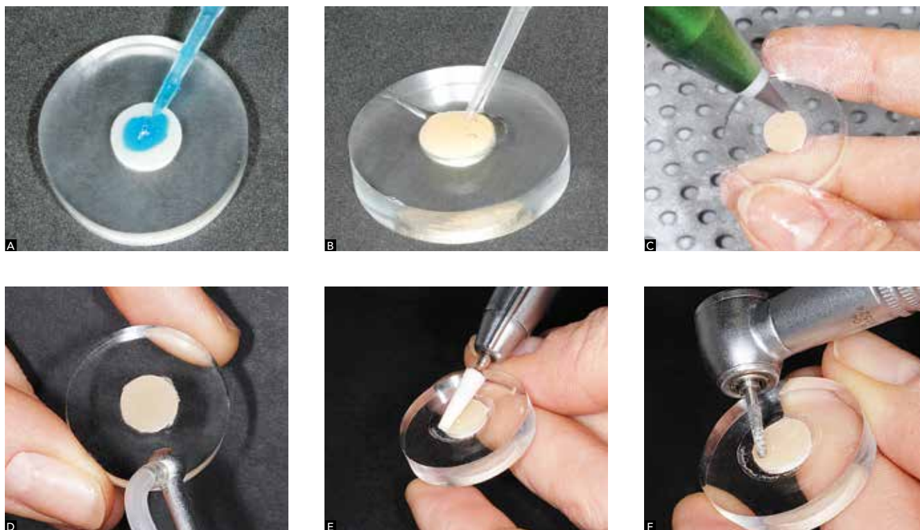
Figure 2 - Surface treatment using: A) 37% phosphoric acid, B) hydrofluoric acid, C) aluminum oxide blasting, D) sodium bicarbonate blasting, E) mounted stone, and F) diamond bur.