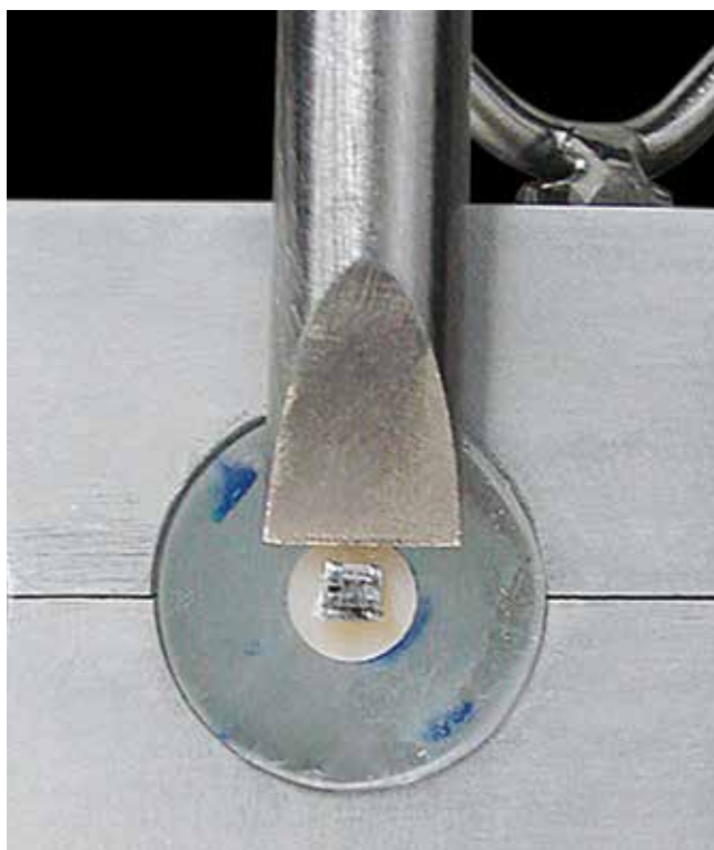
Figure 4 - Bracket shearing in an Emic DL 10000 MF universal testing machine. Note the metallic support for fixation of specimens.