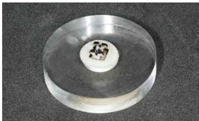
Figure 3 - Orthodontic Brackets bonded with Transbond XT light-cured resin onto previously treated surfaces.

an explorer #5 (DUFLEX, Petrópolis, RJ, Brazil). Light curing was performed on the whole set for 20 seconds (10 seconds on the mesial and 10 seconds on the distal surface). After bracket bonding, the same storage protocol described above was performed. The specimens were then once again stored in distilled water at 37° C for 7 days for aging.