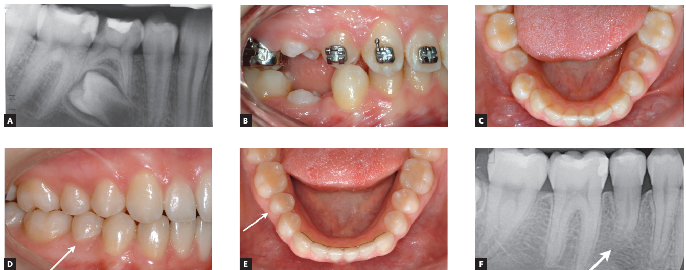
Figure 3 - The ectopic position of the developing mandibular right second premolar was present on the panoramic radiograph of a 12-year-old girl, who was seeking orthodontic treatment due to malposition of her maxillary teeth and Class II malocclusion (A). The premolar was severely distally tilted and the patient and her parents were interested to perform surgical uprighting (trans-alveolar transplantation) of the affected tooth instead of orthodontic extrusion to shorten the treatment time. The transplanted tooth erupted after few weeks into an oral cavity (B, C) and an orthodontic bracket was bonded after eruption into contacts with the opposing premolars. Normal occlusion was established after orthodontic treatment including the transplanted premolar (D, E; arrow). The root of the transplanted premolar continued development after surgery (arrow), but remained somehow shorter than normal (F). Pulp obliteration and normal hard periodontal tissues are also present on the radiograph.

Spot ankylosis is practically impossible to detect on radiographs, and the best way to confirm it is by applying orthodontic traction to the suspected transplant. If the transplant does not respond to orthodontic forces, while neighboring teeth are moving, then the ankylosis is confirmed.