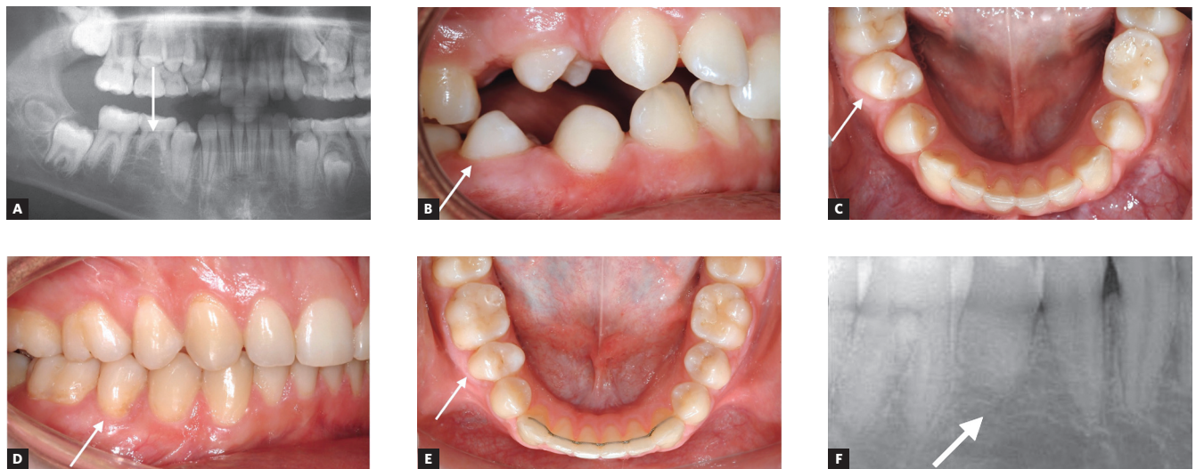
Figure 2 - Congenitally missing lower second premolar on the right side was seen during radiographic examination of an 11-year-old boy with Class II division 2 malocclusion and maxillary crowding (A). The roots of the primary second molar at the site of the missing premolar were short. The treatment plan included transplantation of the developing upper right second premolar (arrow) to the position of the congenitally missing mandibular premolar, followed by the fixed appliance treatment to close the extraction space and establish normal overjet and overbite. The transplanted premolar (arrow) erupted spontaneously in the oral cavity six months after transplantation from the subgingival position after surgery (B, C). The fixed appliances were bonded two years after transplantation and eruption of all permanent teeth. Normal tooth contacts were established after orthodontic treatment and overjet and overbite were corrected (D, E). Pulp obliteration and no hard tissue pathology were present at the transplanted premolar (F).