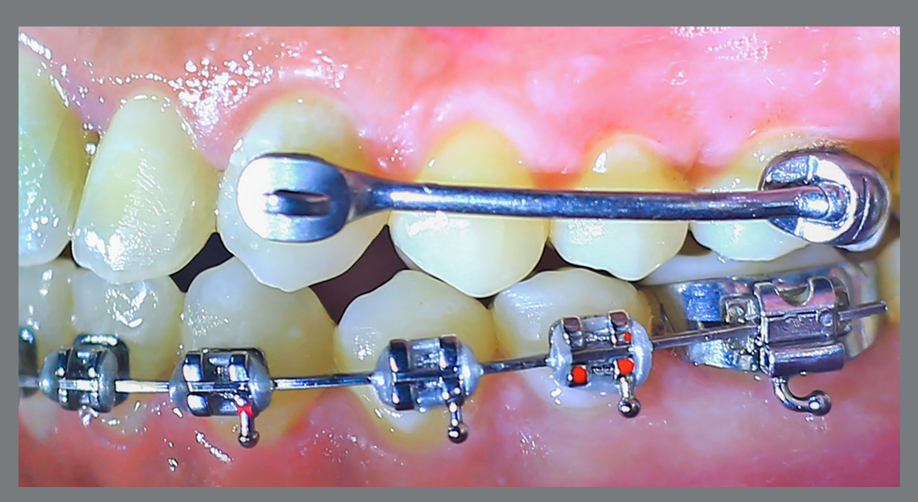
Figure 2: Bonded Carriere distalizer appliance.

Effect of second molar eruption on efficiency of maxillary first molar distalization using Carriere distalizer appliance