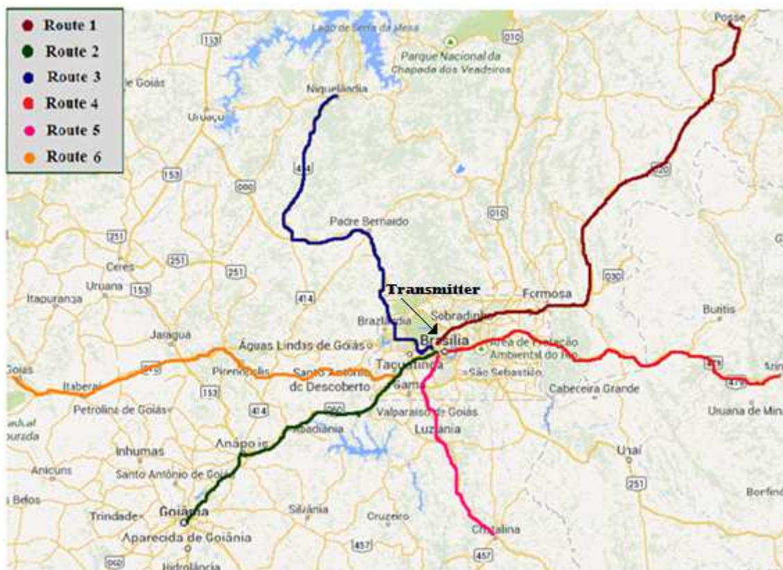
Fig.1: Environment of measurements

The transmission system consisted in a Medium Wave generator, which was mounted at the Radiobras headquarters in Brasília, located in Block 1, Lot S / N, in the Plano Piloto. Table I shows the characteristics of the transmitter.