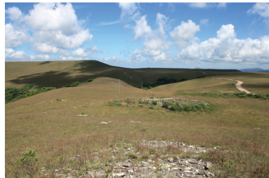
Figure 3. Habitat where Cladonia dimorphoclada was found in Southern Brazil, Municipality of Urubici, São Joaquim National Park.

cortex and stereome intermixed with medulla, and the production of usnic acid as the only secondary compound.