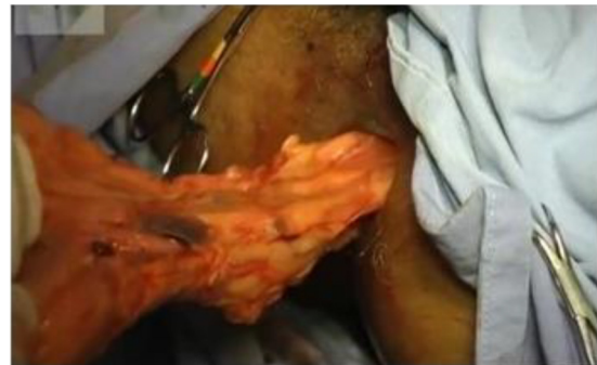
Fig. 3 – Transanal surgical specimen removal.

Dublin, Ireland). In these cases, shortly after the specimen removal, suture in the remnant colon bag was performed and the stapler warhead was fixed. The EEA HEM ® anoscope portal was then placed and fixed to the skin and the distal stump pouch was sutured. Finally, the warhead was attached, followed by the stapler closure (Fig. 4a-c), and the pneumoperitoneum was redone. The position of the lowered colon was checked and a final revision of the abdominal cavity was performed, as well as the repair of the ileum loop to make a protective ileostomy. Then, pneumoperitoneum was undone, stapling was performed, and stapled line was checked, transanally, in order to make reinforcement and/or hemostatic points whenever necessary.