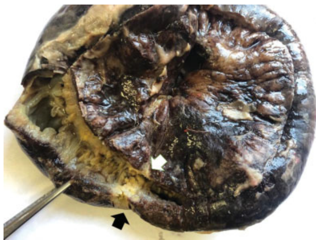
Fig. 3 Anatomopathological examination of the resected jejunum. A stricture can be observed at the site of the tumoral lesion (white arrow), with the perforation being evident in the antimesenteric border (black arrow).

males and a median age at diagnosis of between 55 and 66 years old. 1,6 Of these types of tumors, only 13.2 to 31% of cases seem to affect the jejunum, with the duodenum acting as the main location in most patients (between 48 and 73.6% of cases). 3