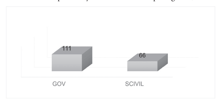
Figure 1: Total amount of politically relevant discourses per segment, 2009 and 2013*

This data, disaggregated to facilitate observation of the politically relevant discourses of each individual organization, reveals some interesting findings. The distribution of politically relevant discourses related to the government sector is presented below in Figure 2.