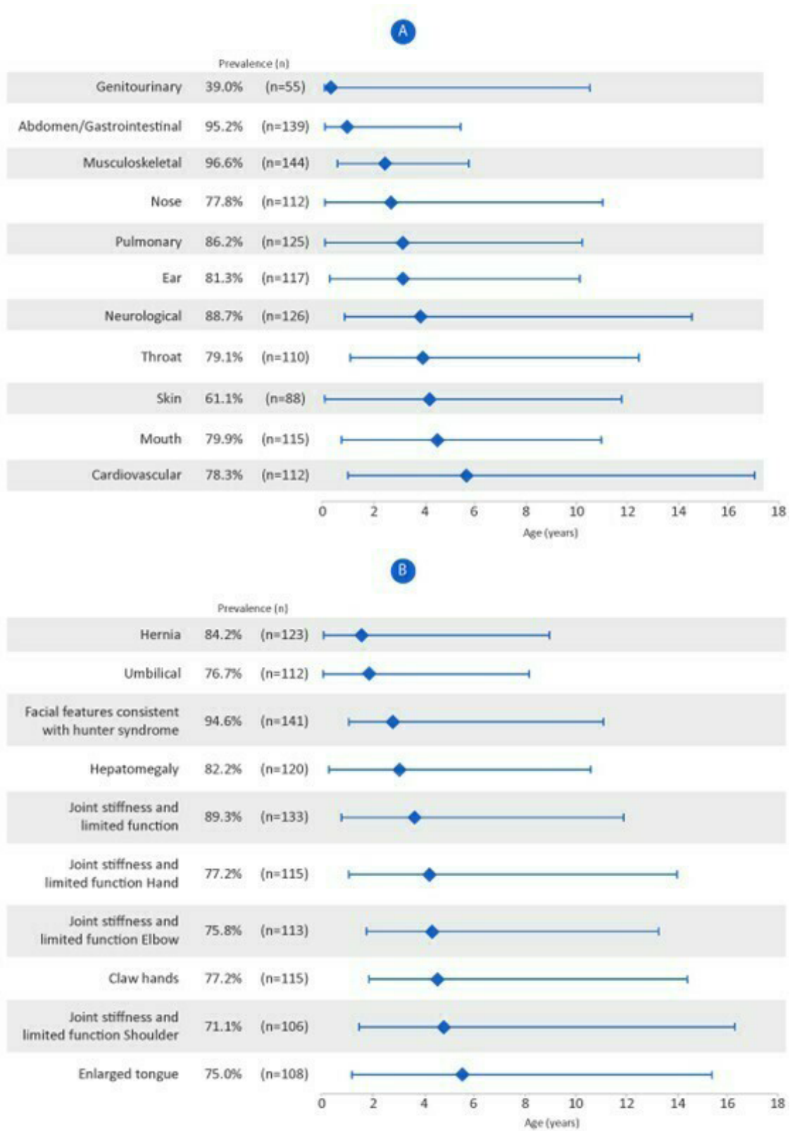
Figure 1. Disease manifestations and signs and symptoms in the overall HOS population. Prevalence and median age at onset of (a) organ system involvement and (b) signs and symptoms present in more than 70% of patients in the overall HOS population. Diamonds represent the median age of onset (years) and error bars indicate the 10 th and 90 th percentiles.