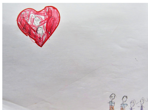
Figure 3. In the drawing, the child shows her family.