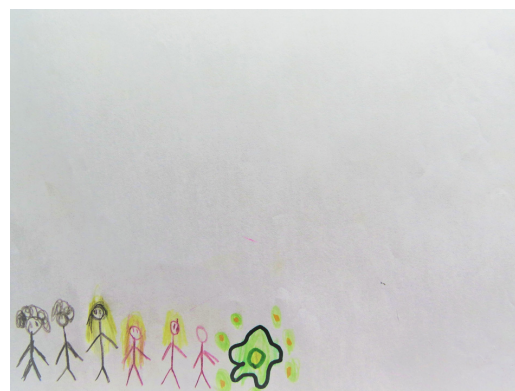
Figure 2. Drawing in which the child shows the disease as a monster.