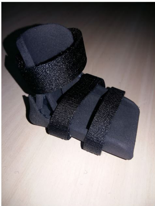
Figure 1. Model of the brace developed in the study. All the devices were manufactured individually from a mold created by the occupational therapist, using 4 mm-thick EVA, flat irons, scissors, Velcro and hot glue.

Variations in measures and the confidence interval (95% CI) of the Pirani score of all the assessments are shown in Figure 3. Multivariate analysis demonstrated differences between assessments ( p = 0.001 ), and in