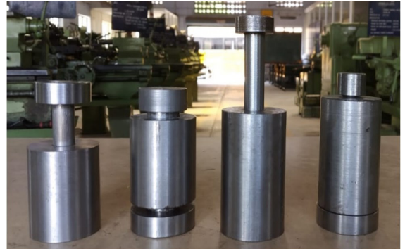
Figure 1. Cold compaction dies used to prepare powder metallurgy specimen

The wear tests are conducted as per ASTM G99. The specimen dimensions are of diameter 10 mm and length of 25 mm. The wear rate is measured with the help of pin