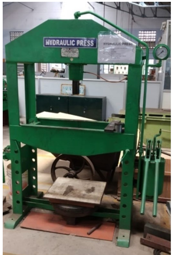
Figure 2. Hydraulic press of capacity 40T