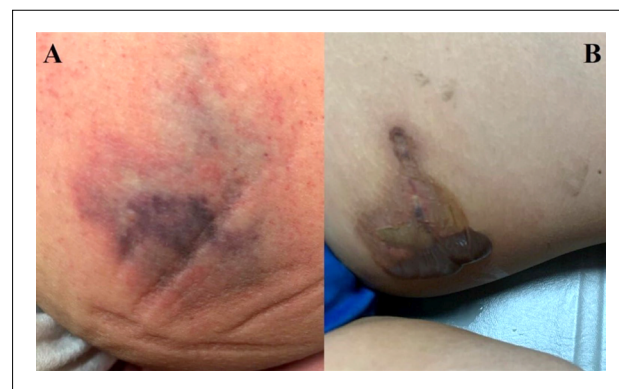
Figure 1. Skin lesions resulting from the bite of the Loxosceles spider. A: Lesion located in the inner region of the left thigh, measuring approximately 4 cm in diameter, exhibiting an undefined appearance with the presence of a livedoid plaque characterized by areas of erythema, ischemia, and necrosis, from the periphery to the center. B: Formation of vesicles with serohematic content, with irregular borders, delimited by an area of hyperpigmentation

Sixteen hours after the bite, the patient presented with an erythematous lesion measuring 2 cm in diameter with an indurated erythematous perilesional area or a bull's-eye measuring 16 cm in diameter, with irregular edges and considerable pain upon palpation ( Figure 1A ). Treatment was initiated with dapsone 1 mg/kg