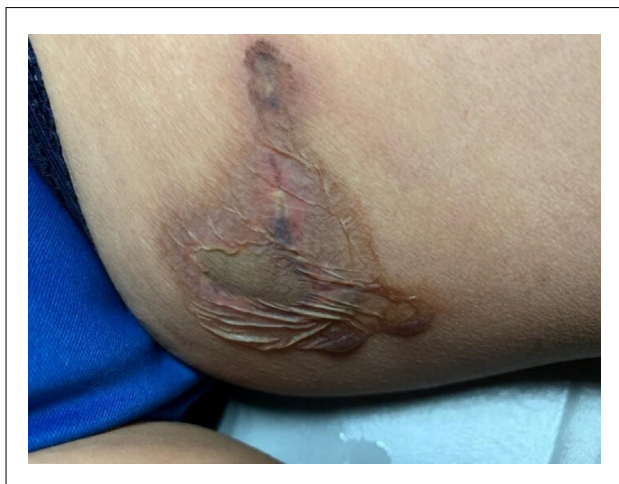
Figure 2. Lesion with irregular borders, necrotic background, delimited by an area of hyperpigmentation and erythema, showing exudate coming out of the vesicles

This systematic review was conducted in accordance with the guidelines of the Report of Paper for Systematic Reviews and Meta-Analyses ( Figure 5 ). 11 The study was developed and submitted to the International Prospective Register of Systematic Reviews. The Scopus, PubMed, Web of Science, and Google