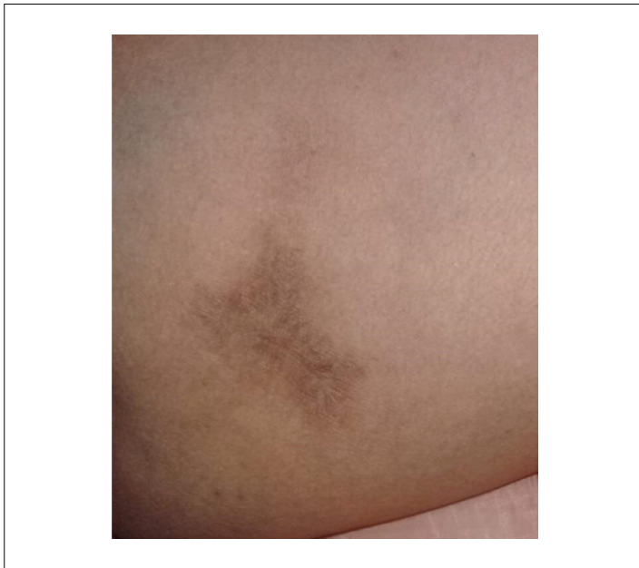
Figure 4. Complete remission of the lesion, discoloration, or formation of mild scar tissue