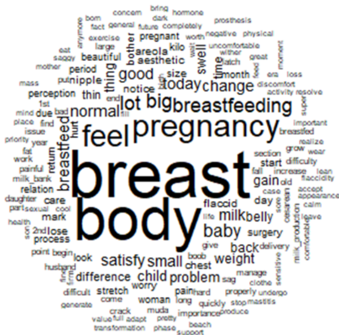
Figure 3 – Word cloud description. Vitória, Espírito Santo, Brazil, 2022

Even though these changes are normal for the physiology of women in the gestational and puerperal period, they are often not understood in this way, negatively interfering in the way the woman perceives herself (3,4,8-11) . The perception of the woman suffers interference from the dynamic interaction between mother and child, as well as the biological conditions and body image can interfere in this interaction. This character of reciprocity of relationships common in the structure of the Interactive Theory of Breastfeeding seems to have been corroborated by the evidence of this research, as well as functioning as an explanatory reference for the processes experienced (5) .