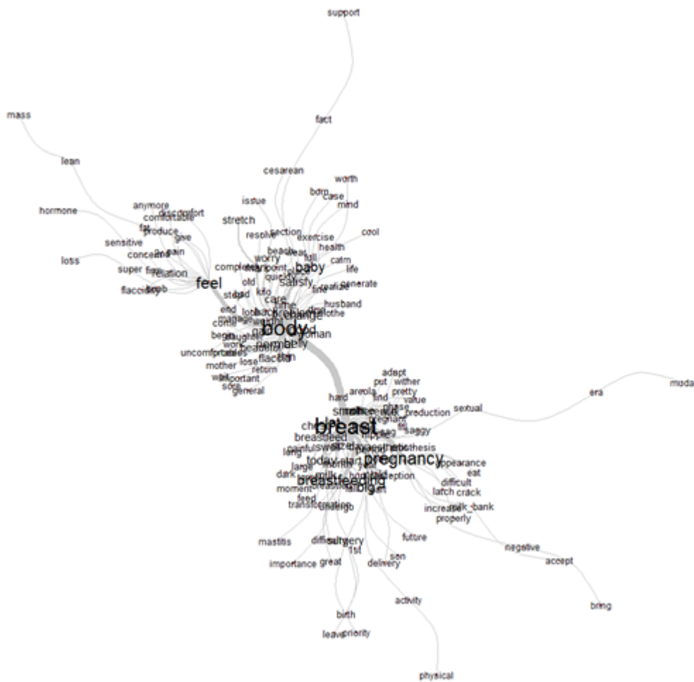
Figure 2 – Similarity analysis. Vitória, Espírito Santo, Brazil, 2022 Source: IRAMUTEQ, Vitória, Espírito Santo, Brazil, 2022.

Regarding the similarity analysis, it was observed that the words breast ( mama ) and body ( corpo ) were used as the central core of the distribution. The word breast connects with the words no, more and stay, while the word body connects the words being and find, as observed in Figure 2.