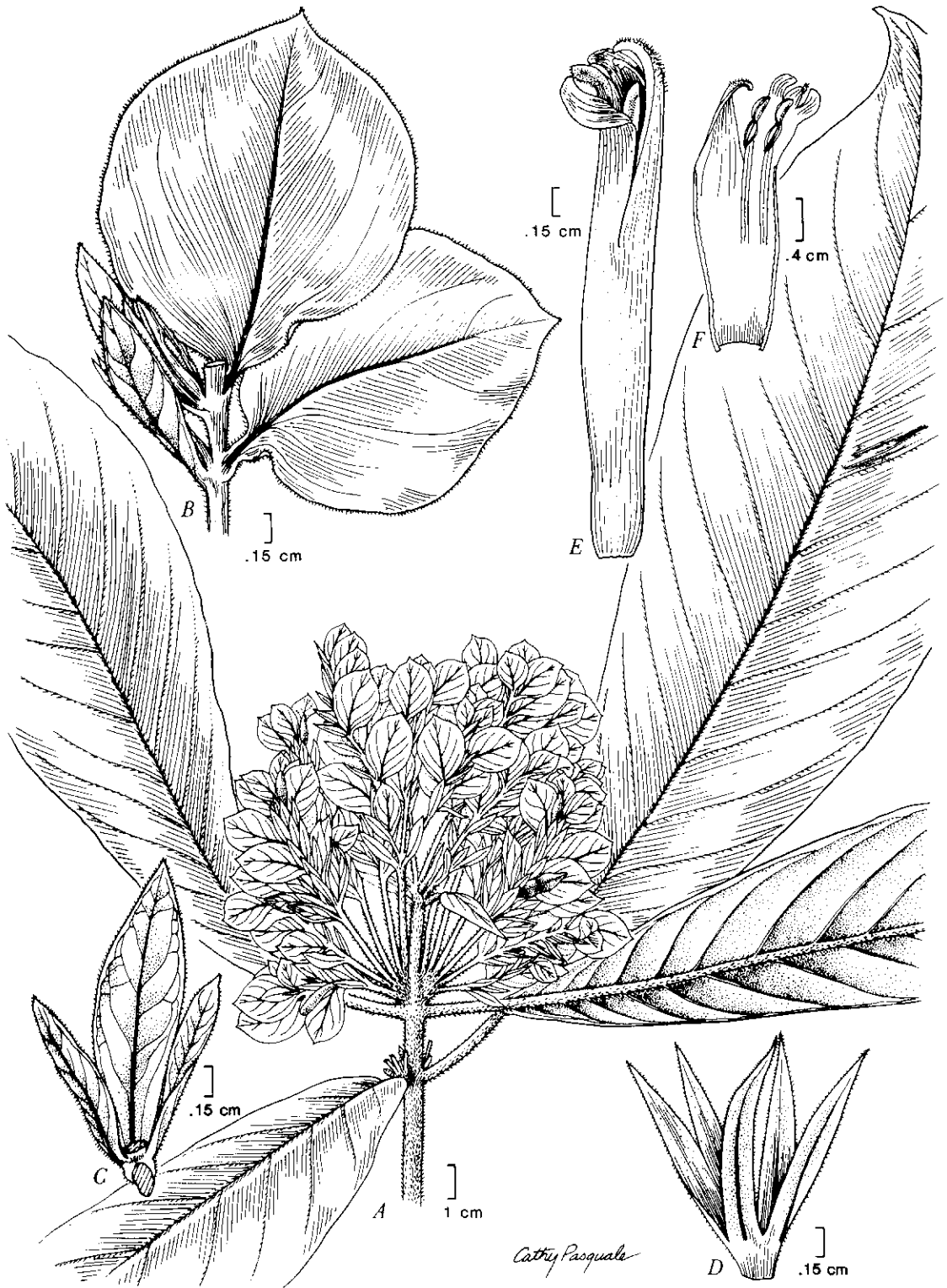
Fig. 1. Justicia zarucchii Wasshausen (Zarucchi et al. 2071): A, habit; B, dorsal and ventral bracts, bractlets and calyx segments; C, ventral bracts and bractlets; D, calyx; E, corolla; F, corolla expanded.