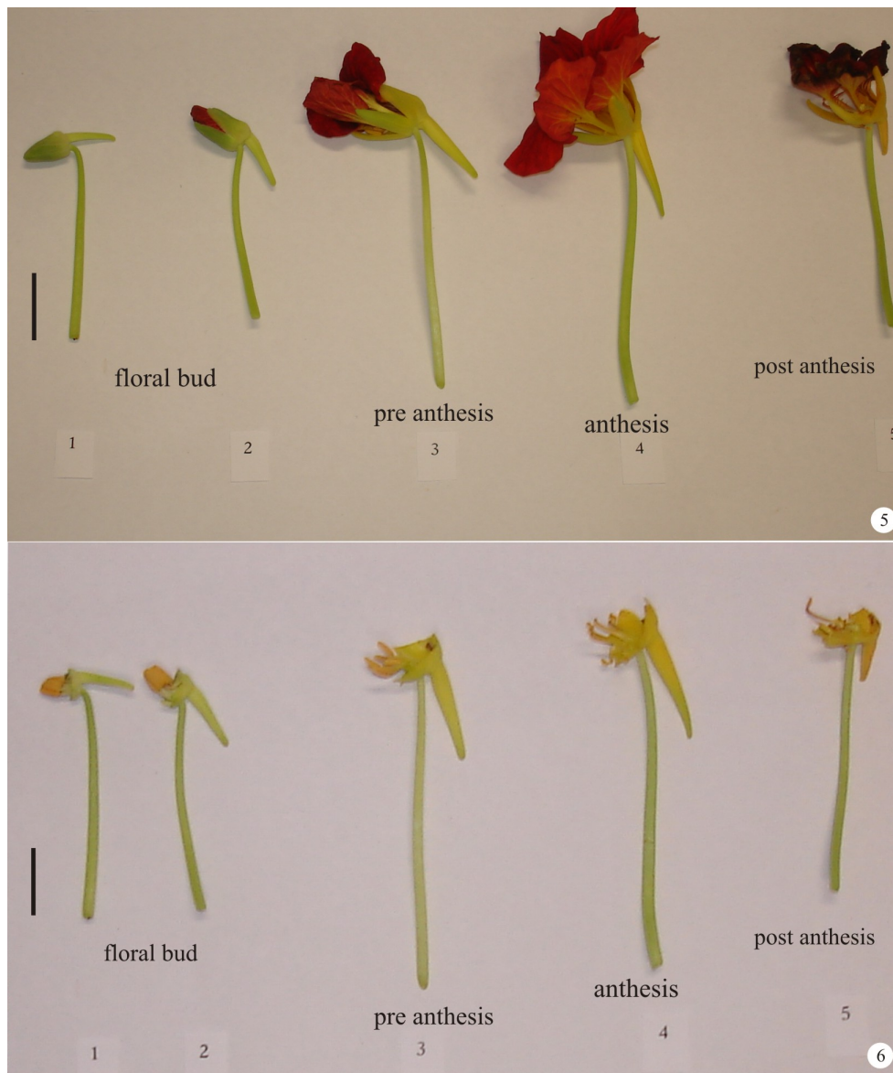
Figs. 5-6 – Tropaeolum majus L. flower, development of the floral bud, flower in anthesis and post-anthesis (from left to right); 5. Phases of flower development with protective verticils; 6. Phases of flower development with protective verticils removed. Bars = 1 cm.

copulation occurred. At other times, they were observed near the calcar, but they did not reach the nectar deposited inside it. On corn flowers, A. variegatus was observed collecting nectar (Embrapa 2000), but on this work this activity was not confirmed probably because the nectary was placed in the calcar and was difficult to access.