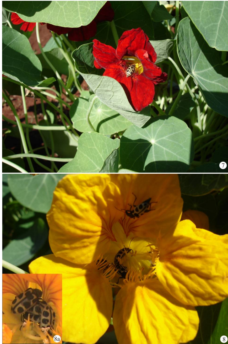
Figs. 7-8 – Astylus variegatus on a Tropaeolum majus L. flowers (7. individual; 8. attached; 8a. detail).

since it walks through all the reproductive system of the flower. Moreover, the compatibility of size between A. variegatus and the flowers offers an efficient contact with their reproductive organs. Based on considerations by Couto and Couto (2006), the adaptation between the floral characteristics of T. majus and A. variegatus behavior is confirmed and, therefore, this species is pres-