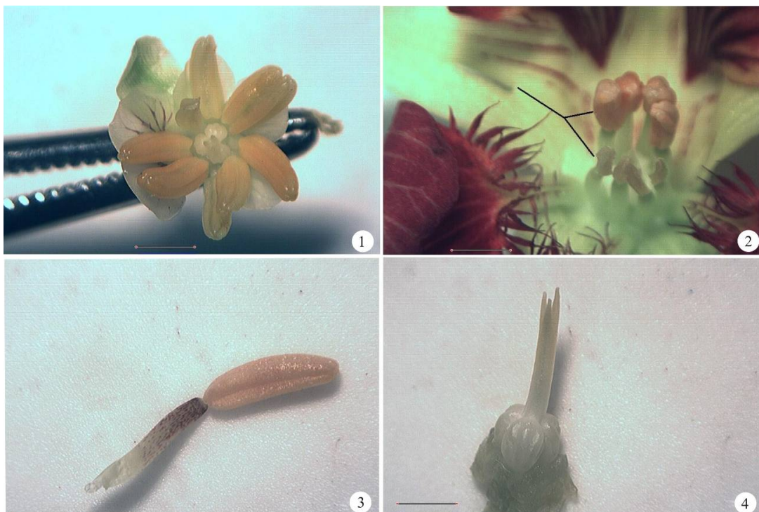
Figs. 1-4 – Tropaeolum majus L. flowers. 1. Group of stamens; 2. Detail of the stamens with different sizes; 3. Stamen; 4. Gynoecium. Bars = 2 cm.

petals were unrolling and the bud was 2 cm length. As the pre-anthesis evolved (3), the petals were kept away and a non-synchronized increase of the stamens was observed. The anthers presented a slight curvature to the outside, the petals were alternately arranged with the sepals and the anthers curvature was bigger, concluding their opening. On the anthesis (4), the petals were totally separated and arranged among the sepals, and with the flower presenting a diameter of 4.5 cm to 4.8 cm. The nectar guide is well visible. The androecium presented four bigger stamens, two medium and two smaller ones. The anther dehiscence was longitudinal with a totally twist to the outside (an extrorse dehiscence). On the post-anthesis or senescence (5), the petals presented purplish.