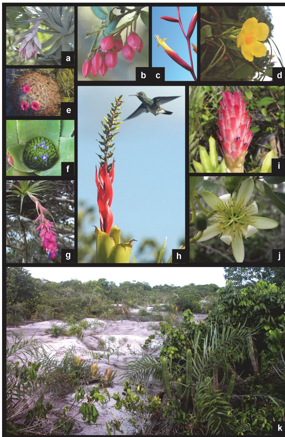
Figure 2 - Plants visited by the hummingbirds inside the studied quadrants at the Restinga de Jurubatiba National Park, Rio de Janeiro, Brazil. a - Tillandsia gardneri , b - Gaylussacia brasiliensis , c - Vriesea neoglutinosa , d - Mandevilla guanabarica , e - Melocactus violaceus , f - Neoregelia cruenta , g - Tillandsia stricta , h - Aechmea nudicaulis with the hummingbird Amazilia fimbriata , i - Quesnelia quesneliana , j - Passiflora alliacea , k - Overview of the studied area.