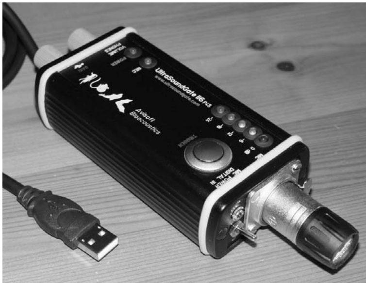
Fig. 1 – UltraSoundGate 116.