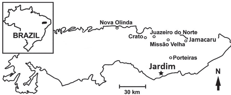
Figure 1 - Geographic position of the sampling site in the town of Jardim, Araripe Basin, south of the state of Ceará, northeast Brazil.