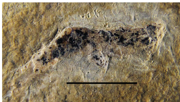
Figure 3 - Lateral view of Kellnerius jamacaruensis (MCNHBJ 339) from Romualdo Formation, Araripe Basin, Brazil. Scale bar: 5 mm.

limited preservation of the material. However, with the characters presented, it is clear to us that this species belongs to the order Decapoda.