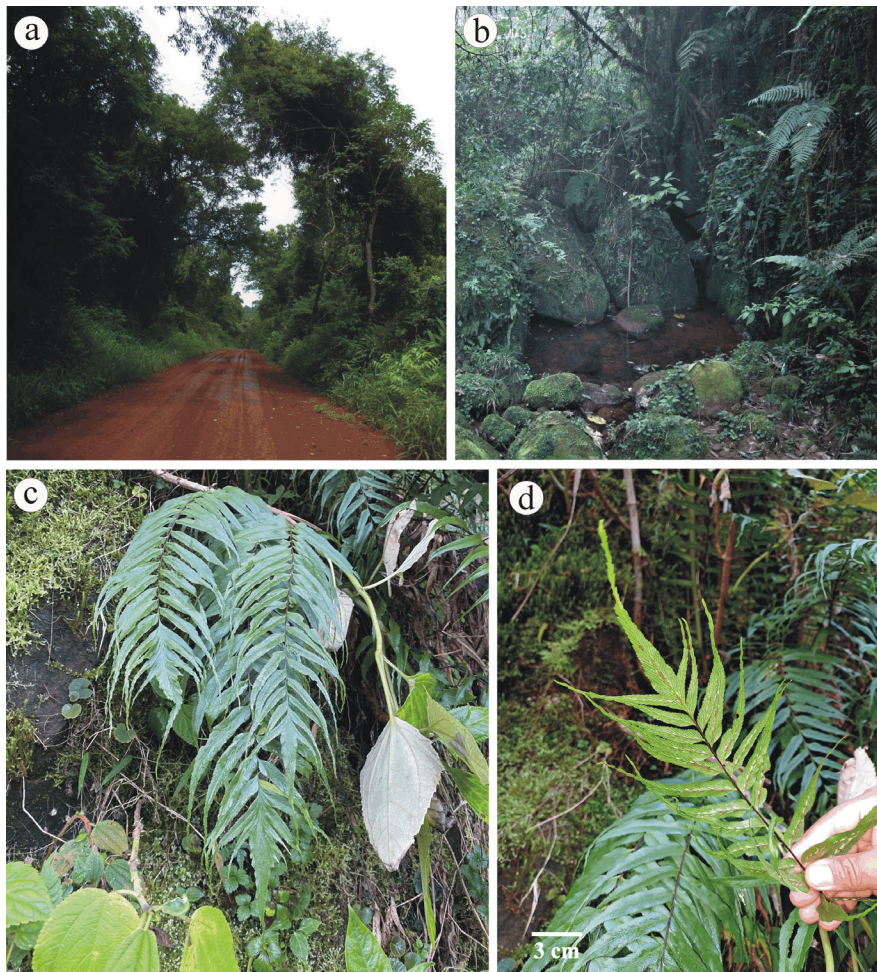
Figure 1. Habitats and habit of Asplenium sylvaticum . a) Paraná biogeographic province at Iguazú National Park; b) Yungas biogeographic province at Calilegua National Park; c) living plant of A. sylvaticum growing in Yungas; d) detail of the frond apical and lateral pinnae.

conspicuous, capitate glandular trichomes (vs. rhizome scales margin without such trichomes in A. achalense and A. serra ). The pinnate fronds with pinnae margin slightly serrate and long caudate apex; apical pinnae conform, similar in size to the lateral ones, with one to four caudate lobes at the base (vs. erect or patent fronds, laminae pinnate, pinnae margin serrate, apex obtuse to acute, apical pinnae entire and half length of the lateral ones in A. serra , and patent to deflexed fronds, laminae pinnate, pinnae margin strongly biserrate, apical pinna pinnatifid in A. achalense ). The spores of A. sylvaticum are 48 \times 45 \mu\text{m} in equatorial diameter, with reticulated perispore and winged folds with equinulated margins and large and numerous perforations, laesura wide with smooth margin