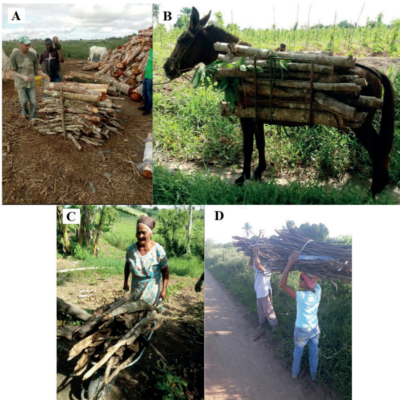
Figure 3. Examples of types of fuelwood amounts: A. Metro; B. Carga animal; C. Carrinho de mão; D. Feixe.

Official government data state that firewood consumption per capita can be calculated using data from the Energy Research Company (EPE 2020) and the Brazilian Institute of Geography and Statistics (IBGE 2019). In 2019, the year of our study, 22,838 \times 10^6 \text{ kg} of firewood and 628 \times 10^6 \text{ kg} of charcoal were consumed in the residential sector. Considering that this biomass was mainly used in cooking activities by 13,989,000 households, composed by 3 members, the annual per capita consumption can be estimated at around 560 kg. The above cited figure considers firewood users along the entire spectrum of fuel stacking behavior. In contrast, the present study focused