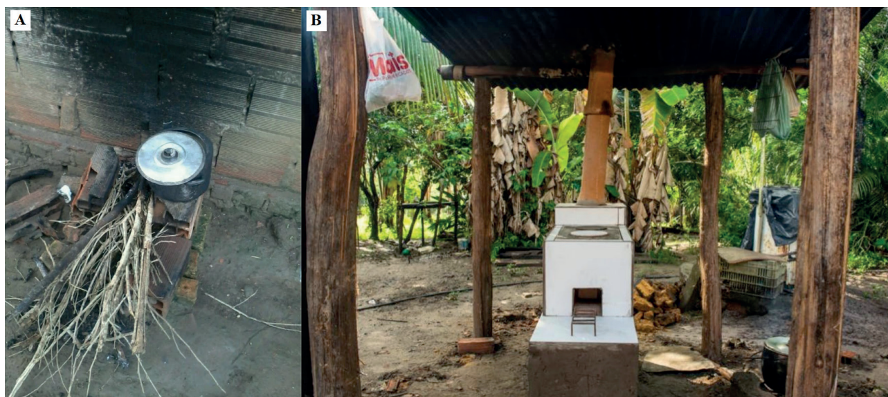
Figure 1. A. Example of rudimentary stove; B. New ecoefficient model.

We conducted a field survey through home interviews with a random sample of the target audience to characterize the profile of firewood users and their baseline firewood consumption. All families that receive Instituto Perene support sign a consent form that addresses some issues including data collection in the context of carbon certification. This data collection is carried out by community agents of the project with a strict protocol of protection in handling and storage using a private digital application. The survey questionnaire included such items as: the family member responsible for cooking, number of adults, number of children, type of fuel, type of stove, and amount of firewood used. The questionnaire was created using the Fulcrum App, which is a program for form creation, data collection, and storage that operates on a portable digital device that can operate offline.