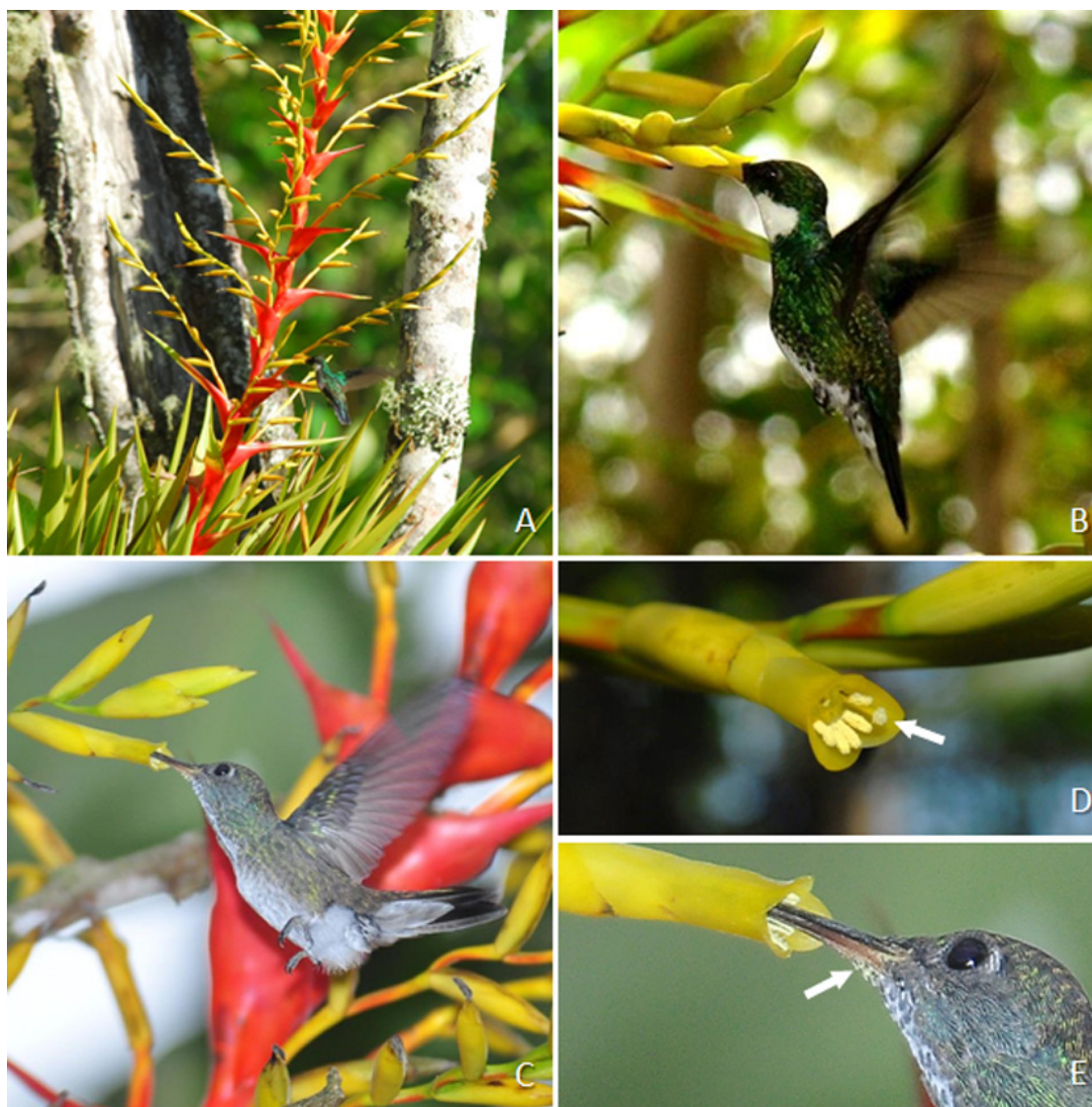
Figure 1. Plant, flowers, and hummingbird pollinators of Vriesea altodaserrae : A. view of plant and inflorescence visited by Leucochloris albicollis ; B. Leucochloris albicollis probing for nectar at a flower; C. Female Thalurania glaucopis visiting flower; D. corolla with stigma (arrow) sided by anthers; E. detail of T. glaucopis visiting flower and the local where pollen is deposited on the base of its bill (arrow).

and 2014. Observations were made directly or with aid of video cameras, totalizing 90h40min. Flower visitors which contacted anthers and stigma during visitation were considered pollinators. The relative frequency of each pollinator species was calculated by dividing the number of visits of each species by the total number of legitimate visits observed for all pollinator species. To characterize hummingbird foraging activity pattern along the day, we calculated the mean number of visits per plant per day for the periods 07h00min-10h00min, 10h01min-13h00min, 13h00min-16h00min and 16h00min-19h00min. Finally, in order to analyse the morphological match between distinct hummingbird species visiting V. altodaserrae and corolla tube of this plant, we measured the length of the corolla tube of 23 individual plants (one flower per plant) and compared to the measures of bill-plus-tongue taken from Vizentin-Bugoni et al. (2014).