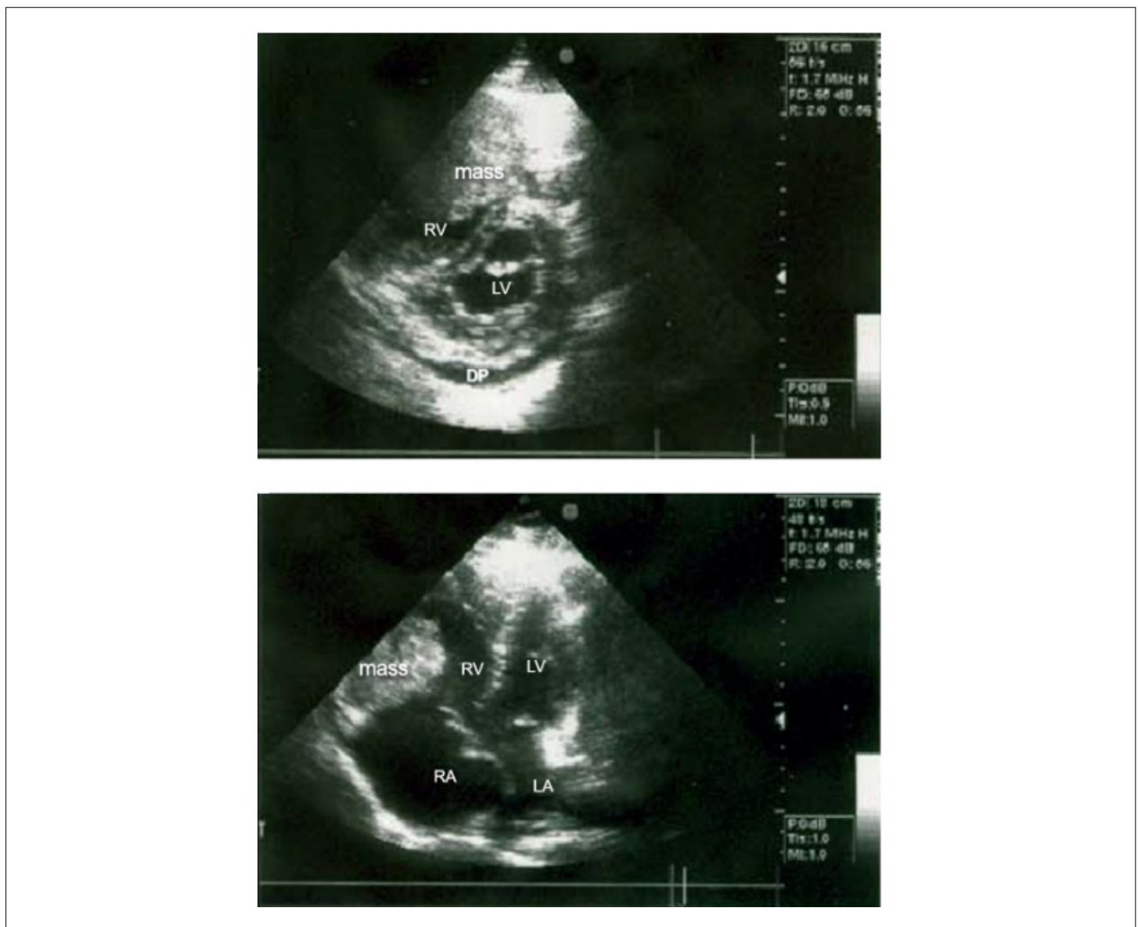
Figure 1 - Transthoracic echocardiography with evidence of right ventricle mass.

Diagnosis was assumed to be disseminated melanoma, with metastasis to lung, heart and brain, with no histopathologic evidence.