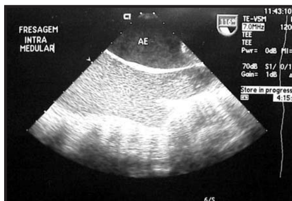
Fig. 1 - During intramedullary milling procedure, a great amount of hyperechogenic material fills out the whole right atrium

preoperative stratification, as it was an urgent surgery, she was submitted to preoperative monitoring with transesophageal echocardiogram for global and segmental ventricular function assessment. During intrabone preparation for rod receiving (milling), a great amount of hyperechogenic (fig. 1), often forming small pieces (fig. 2), was seen entering through the right heart and reaching out pulmonary circulation. As the interatrial septum was complete, an exuberant contrast difference could be seen between right and left atrial content. There was no change of pulmonary, cardiac or hemodynamic function after procedure completion, and the patient had good postoperative evolution, being discharged afterwards.