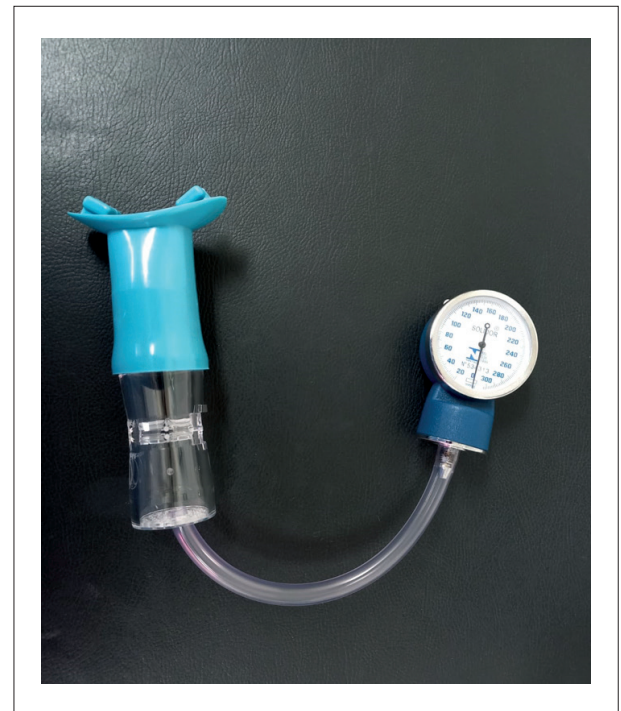
Figure 2 – Simple device for intraoral pressure assessment during the Valsalva maneuver, consisting of a pressure gauge connected to a mouthpiece tube.

Based on the principles described above, all symptomatic patients with HCM and no significant resting LVOT obstructive gradients should be tested with echocardiographic examinations using provocative maneuvers. We suggest that all of them should be tested with a controlled VM (Figure