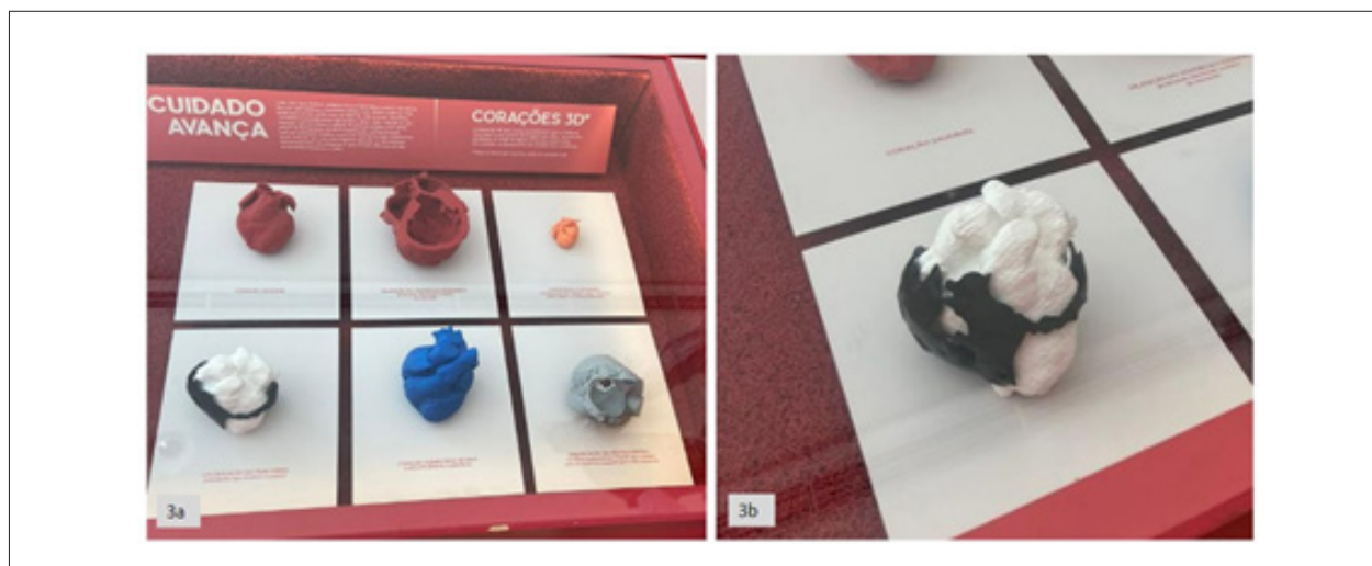
Figure 3 – 3a) Models on display at the renowned Museum of Tomorrow in the exhibition “Heart S2, Pulse of Life”. 3b) Model from the study presented at the Museum of Tomorrow in the exhibition “Heart S2, Pulse of Life”.

individuals in other areas of knowledge, such as mathematics, history, and geoscience. 6