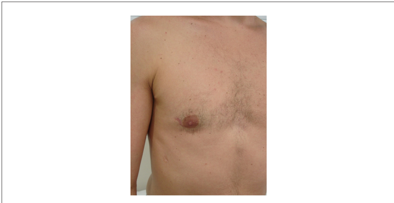
Figure 3 - Final result of the four portals in patient of the video-assisted minimally invasive procedure.

MI D: direct minimally invasive; MI VA: video-assisted minimally invasive; CEC: cardiopulmonary bypass; ICU: Intensive care unit.