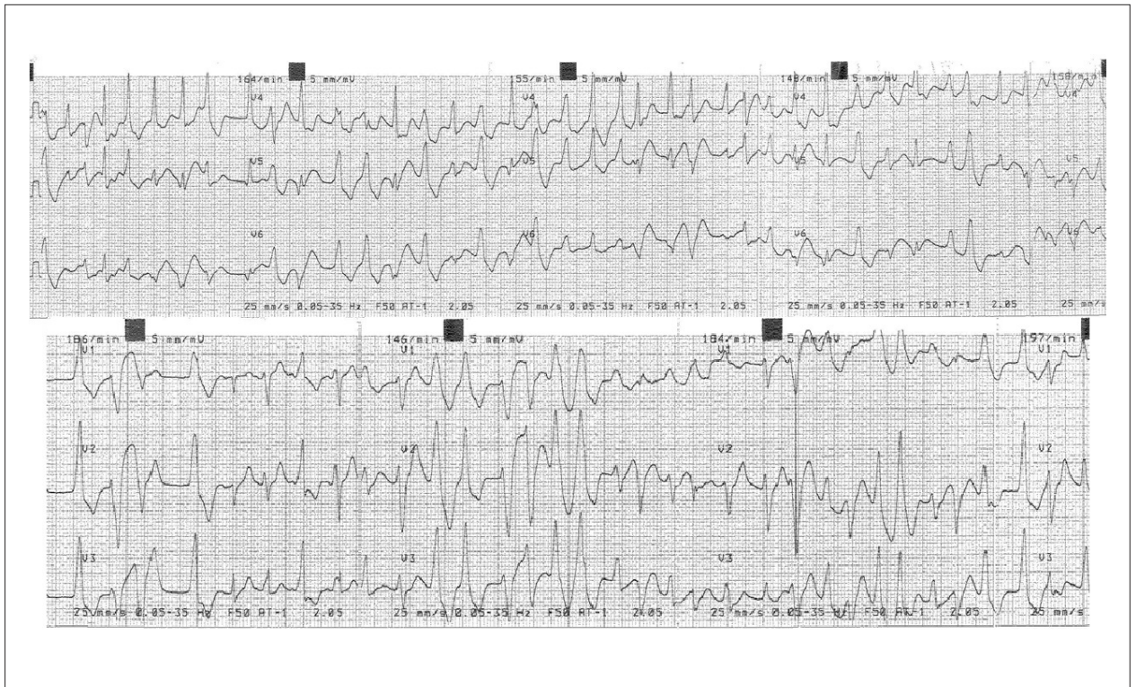
Figure 1 – Polymorphic ventricular tachycardia with intermittent periods of alternating bidirectional QRS axis.