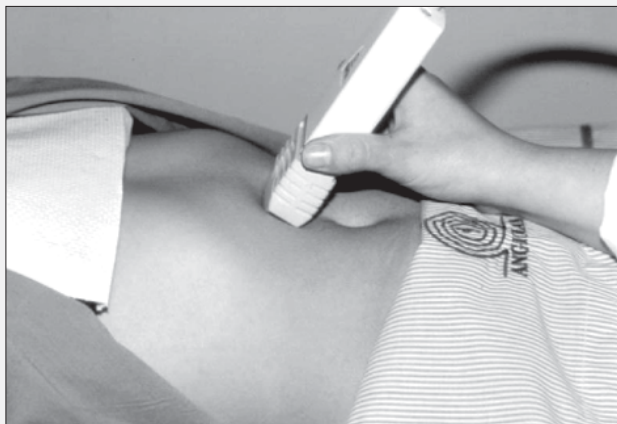
Fig. 1 - Position of the transducer in the epigastric region for assessing the origin of renal arteries.

Anatomically, the renal arteries originate perpendicularly from the proximal segment of the abdominal aorta and travel towards the kidney in an angle of approximately 60°. Therefore, the origin and the proximal segment of the renal arteries were longitudinally assessed on a transverse section of the abdominal aorta in the epigastric region (fig. 1). Based on the section in the epigastric region, depending on the anatomy and biotype of the patient, sometimes almost the entire extension of the renal arteries can be assessed. The distal segments and the hilum of the renal arteries, as well as the measurement of the renal size in the respective lumbar regions, were assessed with longitudinal and transverse sections.