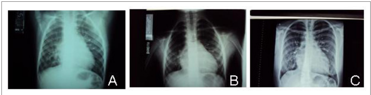
Figure 1 – Chest x-ray sequence showing a mildly enlarged cardiac silhouette (CTI = 0.55), 2, 4 and 21 years (A, B and C, respectively) after tetralogy of Fallot repair, even without significant residual defect. CTI: cardiothoracic index.