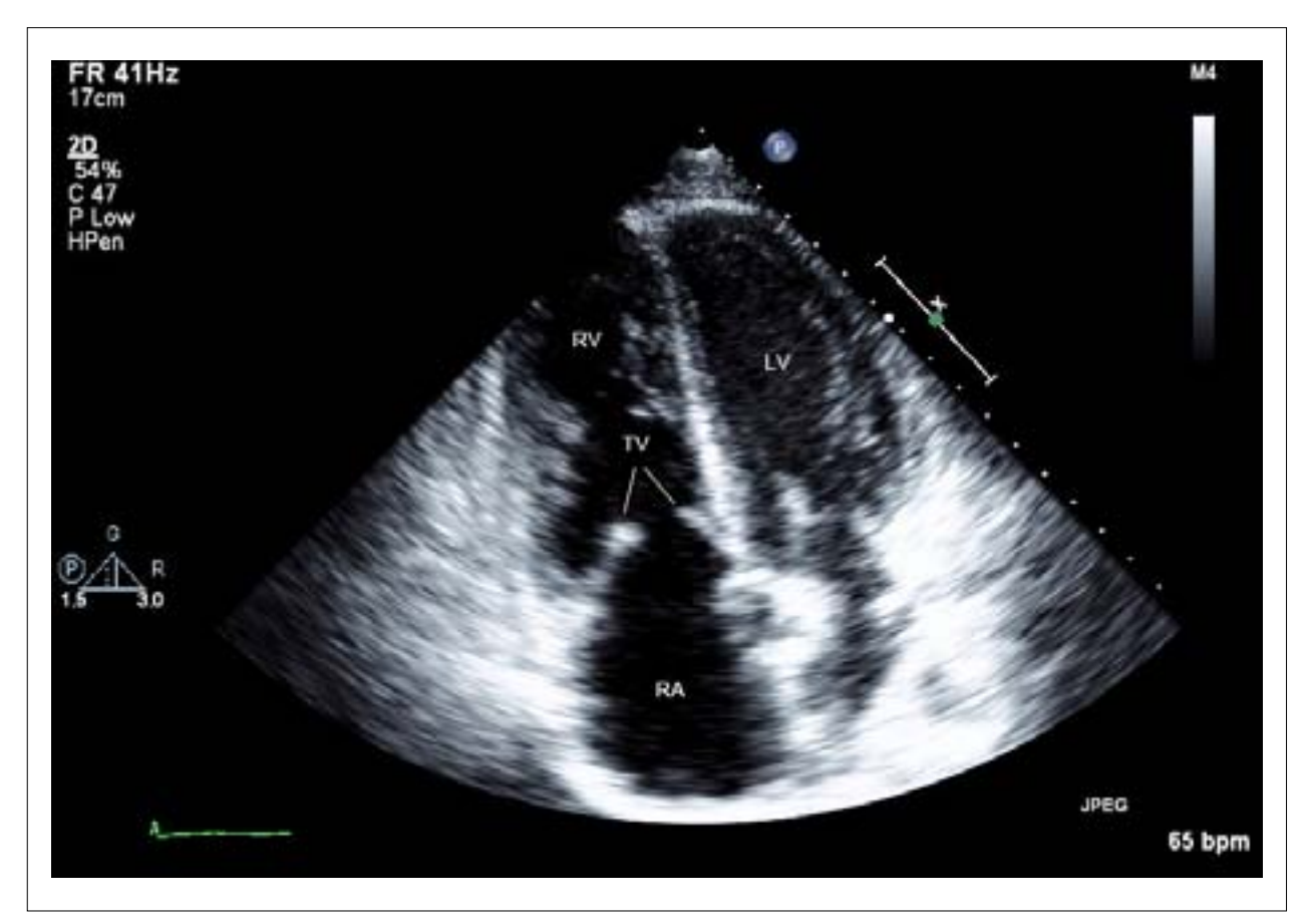
Figure 1 - Apical four chamber view showing thickened, retracted and completely non-mobile tricuspid valve leaflets.

failed to coapt in systole, resulting in severe tricuspid regurgitation. The pulmonary valve was also affected leading to severe pulmonary insufficiency but there was no left-sided valvular involvement. A diagnosis of Carcinoid Heart Disease was made and the patient underwent a successful tricuspid and pulmonary valve replacement.