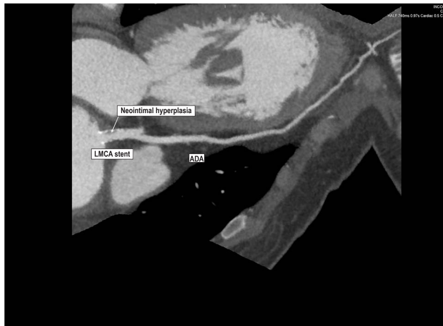
Figure 1 - Coronary CT angiography showing bare-metal stent restenosis in the left main coronary artery (70% obstruction). LMCA : left main coronary artery; ADA : anterior descending artery.