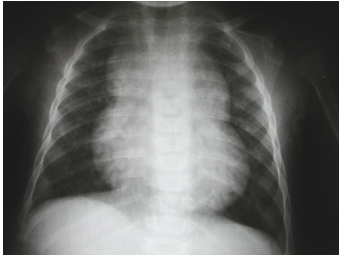
Figure 1 - Radiographic image showing cardiomegaly due to enlarged right cavities and increased pulmonary arterial net, in addition to the "snowman" morphology, usually observed in cases with total anomalous drainage of the pulmonary veins.