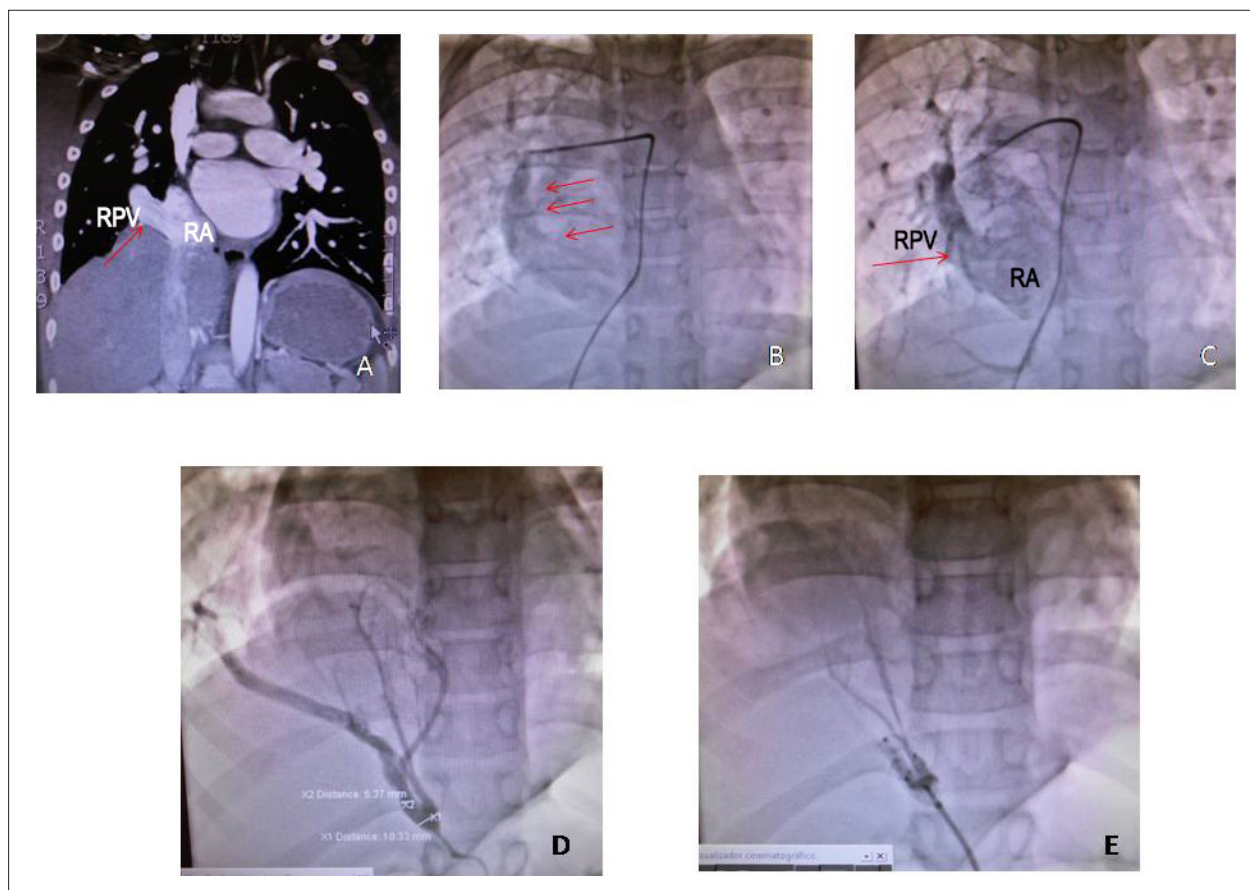
Figure 2 – CT angiography in A showing the right pulmonary vein (RPV, arrow) draining into the right atrium (RA); angiography shows the scimitar sign (arrows) of the RPV in B and draining into the RA in C; systemic-pulmonary collateral vessel emerging from the descending aorta into the right lower lobe (pulmonary sequestration) in D and after its embolization in E.