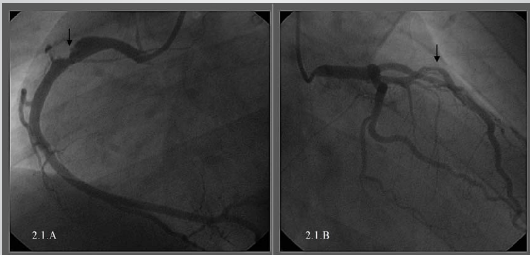
Fig. 2.1.A – Right coronary: Showing ulcerated plaque with thrombus adhered to its surface); 2.1.B – Left anterior descending: showing spontaneous dissection in middle third) (Arrows)