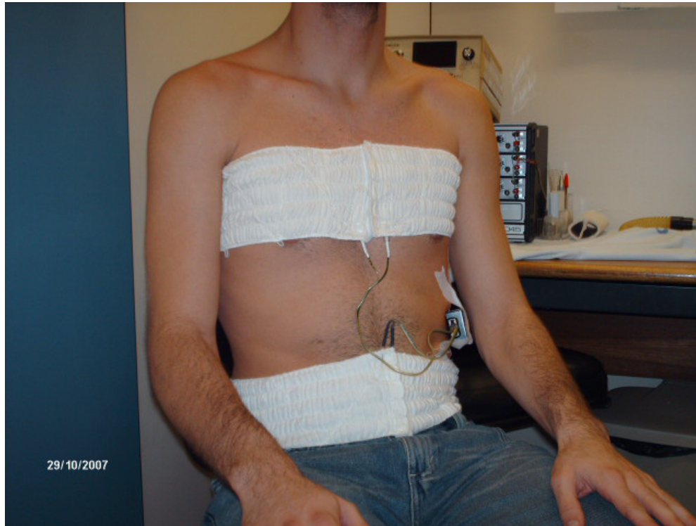
Figure 2 – Thorax and abdominal bands in the sitting position