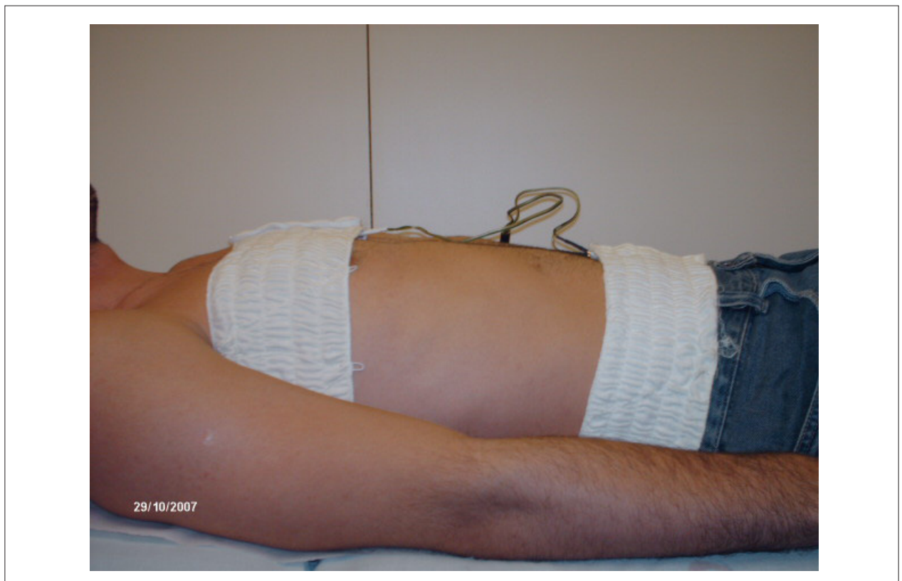
Figure 1 – Thorax and abdominal bands in the dorsal decubitus position

The records of the curves of the rib cage and abdominal movements, and that of their sum were entered into an information system specially developed for that purpose, and the following variables were obtained: tidal volume (VT) in milliliters; total breathing cycle time (TTOT) in seconds; inspiratory time (TI) in seconds; expiratory time (TE) in seconds; mean inspiratory flow (VT/TI) in milliliters per second; effective breathing time (TI/TTOT); respiratory frequency (f)