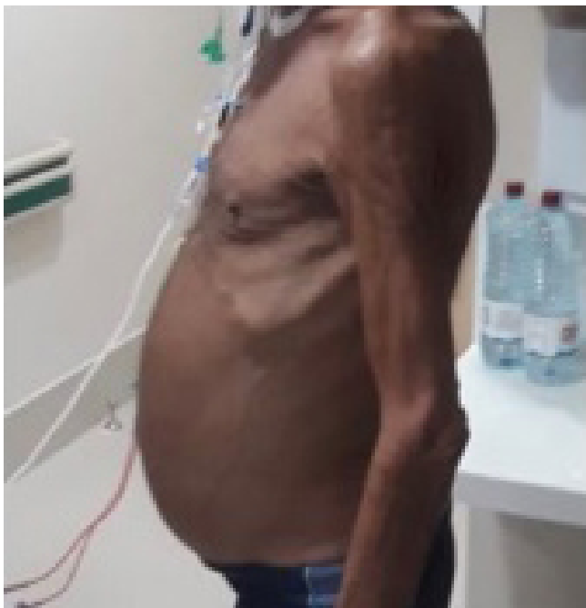
Figure 1 - Patient presenting ascites after pancreatoduodenectomy.

As far as we know, there is no report about chylous ascites following pancreatoduodenectomy and few reports of the