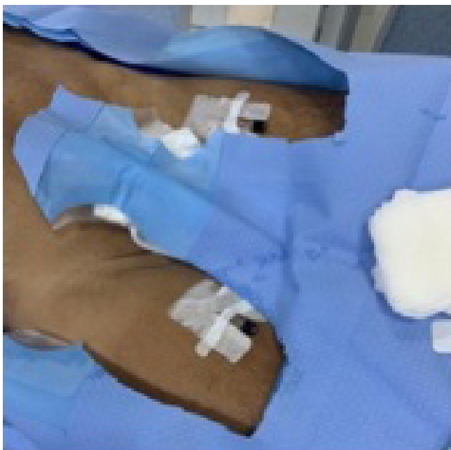
Figure 2 - Bilateral inguinal lymph nodes access for lymphangiography