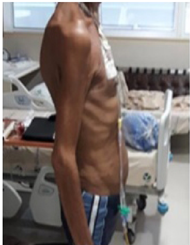
Figure 4 - Patient 9 days after lymphangiography and embolization.