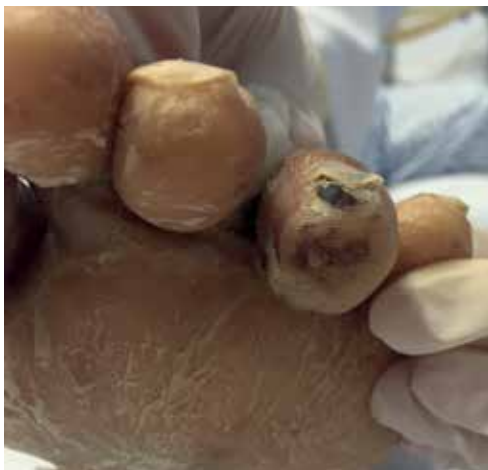
FIGURE 1: Purple macule on the tip of the fourth left toe and scaly sole

The following diagnoses were raised chronic alcohol abuse, presumed metastatic adenocarcinoma of the head of the pancreas, and IE with dermatologic manifestations.