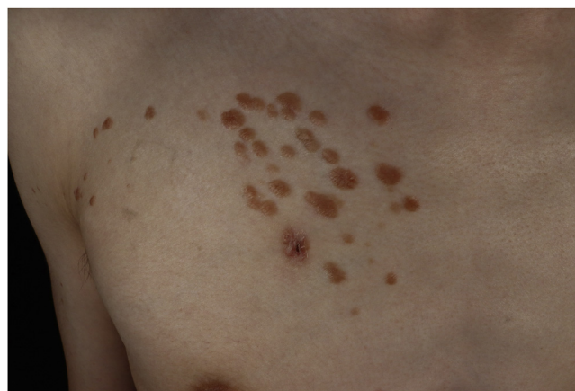
Fig. 2 Closer look on the right chest. There is a wound after skin biopsy at the bottom.