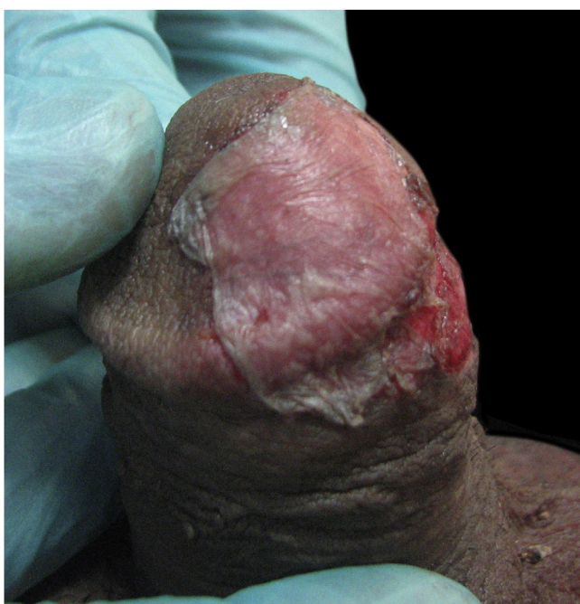
Figure 2 Harvested epidermal graft located over the recipient abraded site.

We believe that the failure of surgical interventions in male genital is related to its mobility, change in size, erection, susceptibility to infection and care, especially during the toilet.