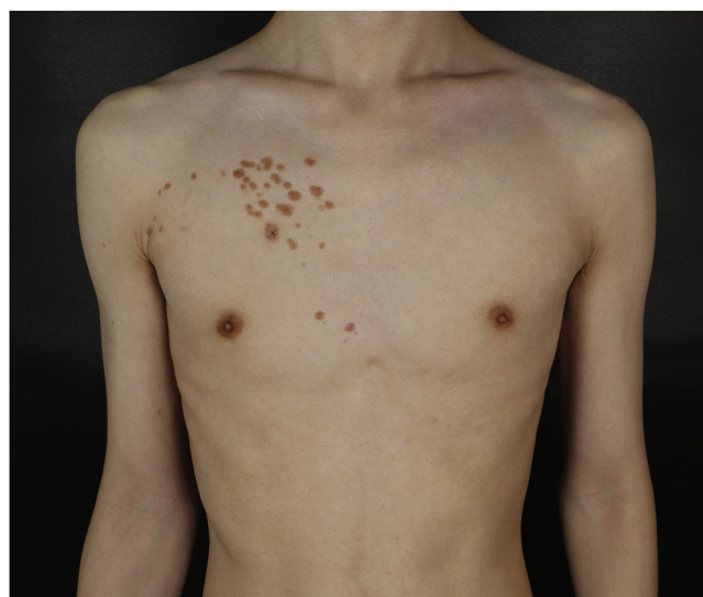
Fig. 1 Physical examination revealed yellowish-brown firm, smooth papules, and plaques on his right chest. Distribution of the lesions followed Blaschko's lines.

syphilis and so on. 2,3 Diagnosis can be confirmed by typical histopathologic manifestations.