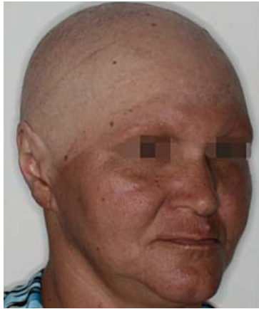
FIGURE 1: Clinical aspect of alopecia