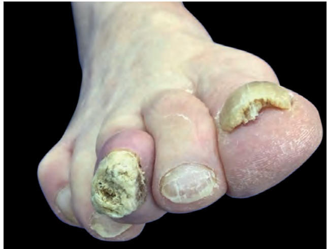
FIGURE 1: Clinical examination. Third toe with important onychodystrophy and an erythematous nodule on the proximal nail border

Onychomatricoma is a rare, slow-growing neoplasm of the nail matrix – asymptomatic in most cases – that may rarely present with pain. 2,3 It mainly affects Caucasian women around the age of 50. It is more common on the fingers than on the toes. However, this conclusion is questionable, since it is an asymptomatic lesion, and consequently, its alterations tend to be more noticeable when they occur on the fingers. 2,3,4 Classically, it manifests itself with the formation of a nail plate of variable thickness, accentuation of the transverse curvature, splinter hemorrhages in the proximal portion,