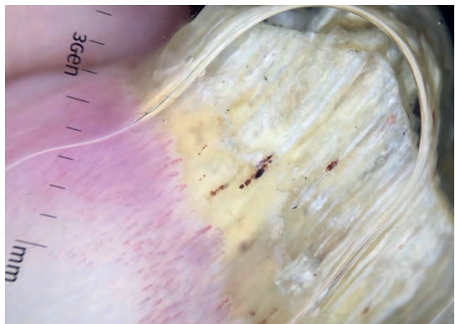
FIGURE 2: Dermoscopy. Splinter hemorrhages, xanthonychia, and white transverse lines