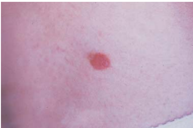
FIGURA 1: Placa eritemato-descamativa, única, bem delimitada, com 4 cm de diâmetro, localizada na região abdominal

The patient was submitted to laboratory evaluation (full blood count, glucose and clinical chemistry) and systemic evaluation (chest x-ray, bone x-ray, a magnetic resonance imaging scan of the head and computed tomography). No abnormalities were found.